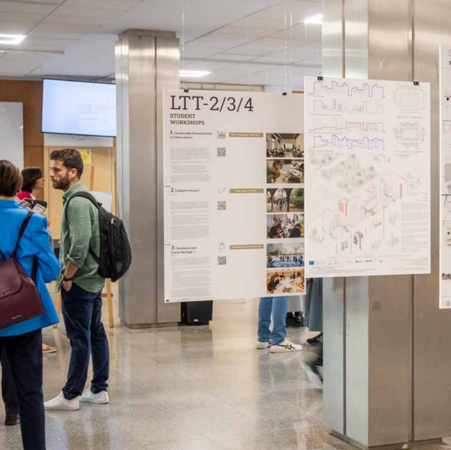
PRESENTATION OF STUDENT WORKSHOPS