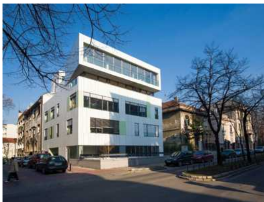
► Stambeni objekat, Ulica Krunska / Residential building, Krunska Street