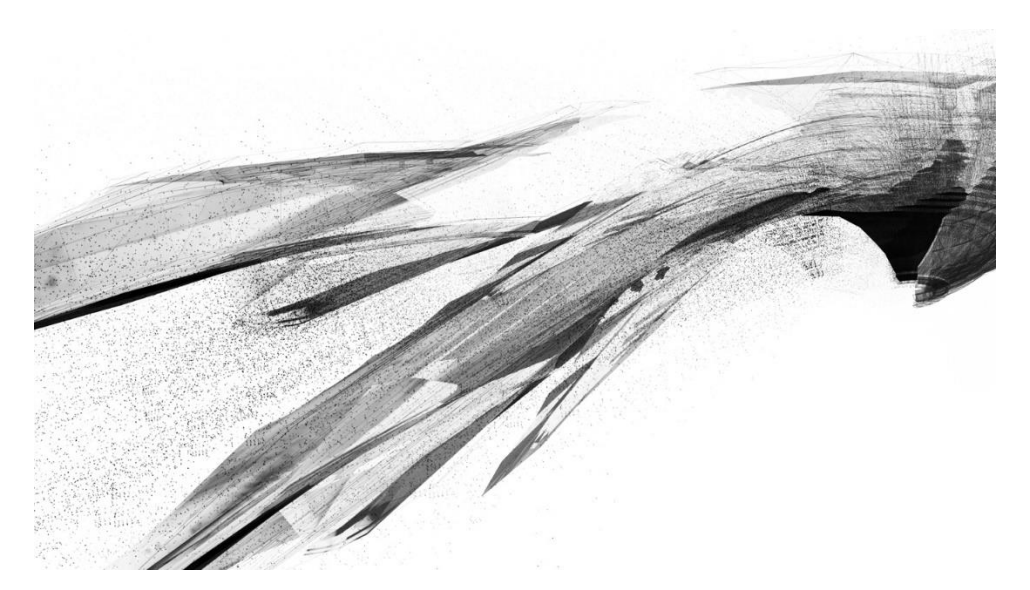
Fig. 3 Fragment 00038944 Complete in its incompleteness, M. Mojsilovic & F. Prica, Digital model, 2018.12:11.19:45

spatiality of the appearance of matter (its actualization), both the subject and the context in which it appears. Massumi sees digitization and the topological paradigm as a neomodernism, characterized by Deleuze's fold to infinity , as well as an extended field of fluidity of form, identity, even the entire discourse. Transition to the virtual structures the form, although it is non-formal conceptually (but also formally), it is more a state within transition, a moment of transition and the intersection of change. Even though the virtual cannot be seen or felt, it cannot not be seen or felt as other than what it is (Massumi, 1998).