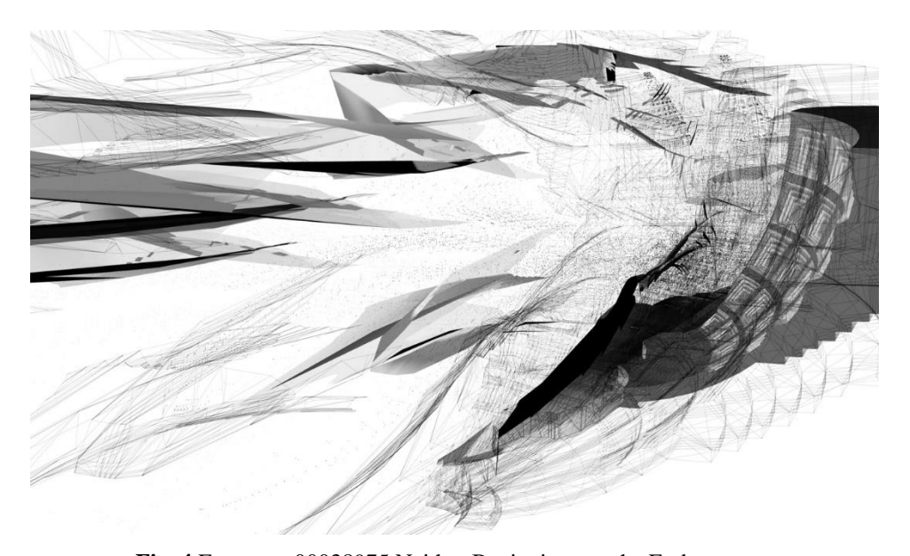
Fig. 4 Fragment 00038975 Neither Beginning nor the End, M. Mojsilovic & F. Prica, Digital model, 2018.19:11.21:36

The condition for the emergence of the formless ( informe ) is the intensification of space that breaks with the intervals of articulated elements of the limited space and the traditional place in which it occurs as free and exceeds the framing of place, plan and programme (Rajchman, 1998). It is a matter of shifting the centre of gravity with a constant movement, motion and disappearance, in folding and folds of forms that capture the void. Multiplicity is the idea of endless folding, or endless becoming and its elusive nature that is in constant motion.