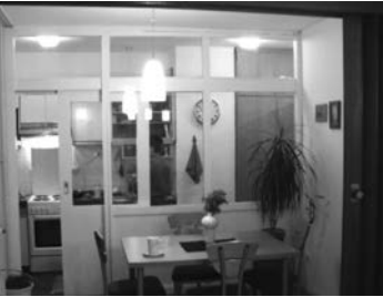
Figure 6-7 Kitchen and dining blocks in residential buildings in Mike Alasa Street in Belgrade, built in 1980 and 1981. These projects include all necessary facilities and programs, designed with prescribed architectural standards by Center for Housing in Belgrade.