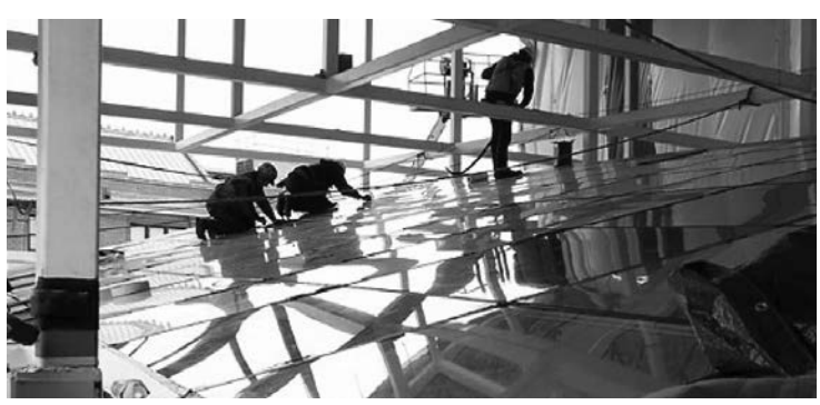
Figure 1 The glass curtain wall of the Wexner Center was overhauled to restore light to galleries darkened by an earlier quick fix.