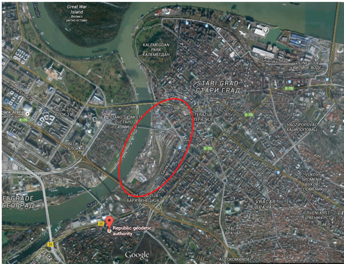
Figure 1. Site location of the project "Belgrade Waterfront"

competition for projects of such magnitude. Although this statement was later retracted, the contradiction was never fully cleared up. In addition, the role of the state in the project remained vague, in particular in terms of its financial commitments in constructing infrastructure at the site before construction could begin in earnest.