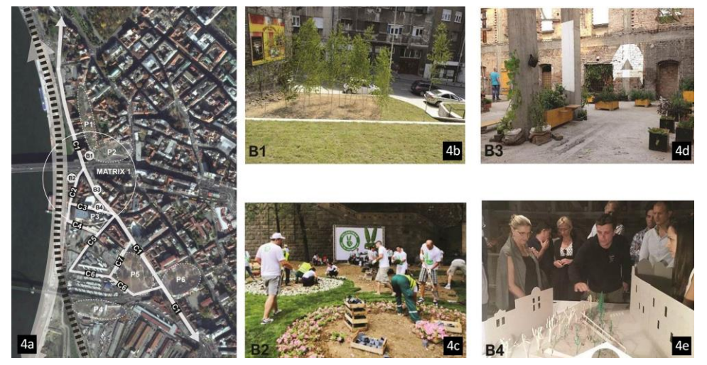
Fig. 4 Elements of GI (4a), "Blue-green dream" (4b, 4c), "Zdravamala" (4d), "My piece of Savamala" (4e). (author: I. Simić)

Savamala urban matrix is defined by a densely built closed block structure, a high percentage of asphalt and other waterproof surfaces, which implies fragmentation and low biotope diversity. Bits of nature are primarily limited to the block areas. However, there has been a recent trend of informal greening in the form of collective actions initiated by local organizations. Within Mikser festival "Blue-green dream" project is organized, which brings together the local community and professionals participating in the greening of public spaces, planting rows of trees, individual trees and placing of urban furniture for horticulture (Figures 4a, 4b). Public workshop on urban gardening "Zdravamala" (Figure 4d) was held within the "Spanish house" which is currently used as an informal public space (Zdravamala, 2014). The participatory workshop "My piece of Savamala" (2015), which addressed the new solution for free public space in Karadjordjeva Street, was held in the organization of "Mixer House" and "Urban Guerrilla". This action has implemented a method of participatory design by involving various actors - the local people, experts in the field of urban planning, architecture, ecology and engineering, as well as city and local authorities (Figure 4e).