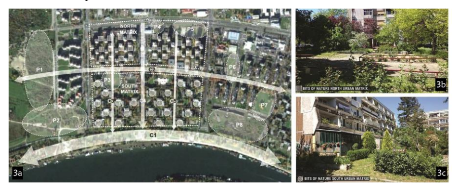
Fig. 3 Elements of GI (3a), bits of nature north urban matrix (3b), bits of nature south urban matrix (3c). (author: I. Simić)

For the planning and design of future GI, above recognized bits of nature transformed by informal activities are of great significance because it connects the levels of micro and macro, blocks with riverside areas and rivers, offering continuity of greenery. This is very significant for block inhabitants as it offers constant protection against elevated temperatures and sunlight, creating an integral space of rich biodiversity and connectivity of habitat for plant and animal species.