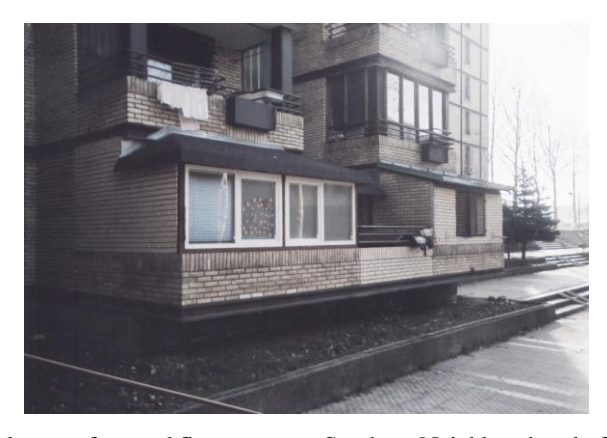
Fig. 5 Informal closure of ground floor terraces, Southern Neighbourhood of Cerak Vinogradi.

At the first glance, the user interventions seem as a natural response of alienated residents: participation was almost impossible in the conditions of the estate's design and construction. The principal position prefabrication and industrialisation were given within the whole endeavour would make architects such as Lucien Kroll shiver of the mere rigidity such arrangements imply (Kroll, 1987). Architects worked in numbers and under deadlines which signal an industrial atmosphere, with almost no room being provided for the users. Simultaneously, the users' represented their interventions as a reaction to the numerous defects of the estate, including leaks, bad isolation and small apartment space. One of them, Milica Kerkez, explained in a letter to Milenija Marušić that she glazed her ground floor logia due to the frequent thefts, a lack of storage space and the apartment's low temperature.