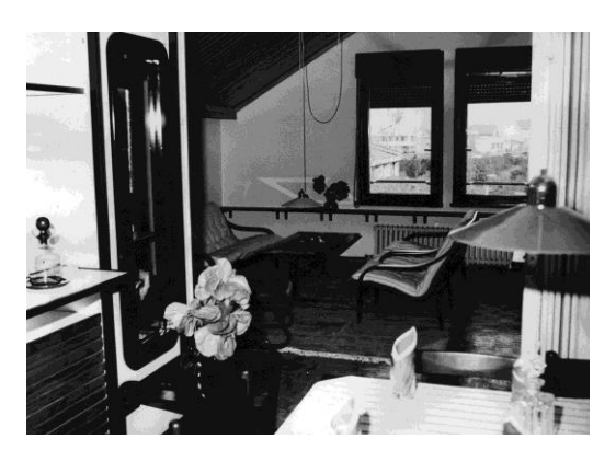
Fig. 4 The fully furnished apartment (type E1), on the first floor of the TRC.

In 1979, the Marušić couple were ordered to start working on a proposal for 'Cerak 2,' as the south-west extension of the original design ('Cerak 1'). One part of the proposal was the "Western Neighbourhood", with 1,146 apartments organised around two pedestrian streets. The descending local terrain was used by the architects to situate an amphitheatre, with a small lake and a special plateau so residents could organise communal barbeques and meet and socialise (Marušić, Marušić, 1987, p. 133-134): all of these activities would, hopefully, strengthen the integrity of the community. Another novelty was the "Test and Research Centre" (TRC), drawn in 1982 by the Marušić couple and architect Nadežda Tankosić. Initially envisaged as a test site, the TRC was designed as a temporary structure housing the offices of the architects, investor and developer. A two-story building of some 580 square meters, the TRC was also an exhibition space dedicated to Cerak 2, presenting drawings, models and two fully furnished apartments (Fig. 4).