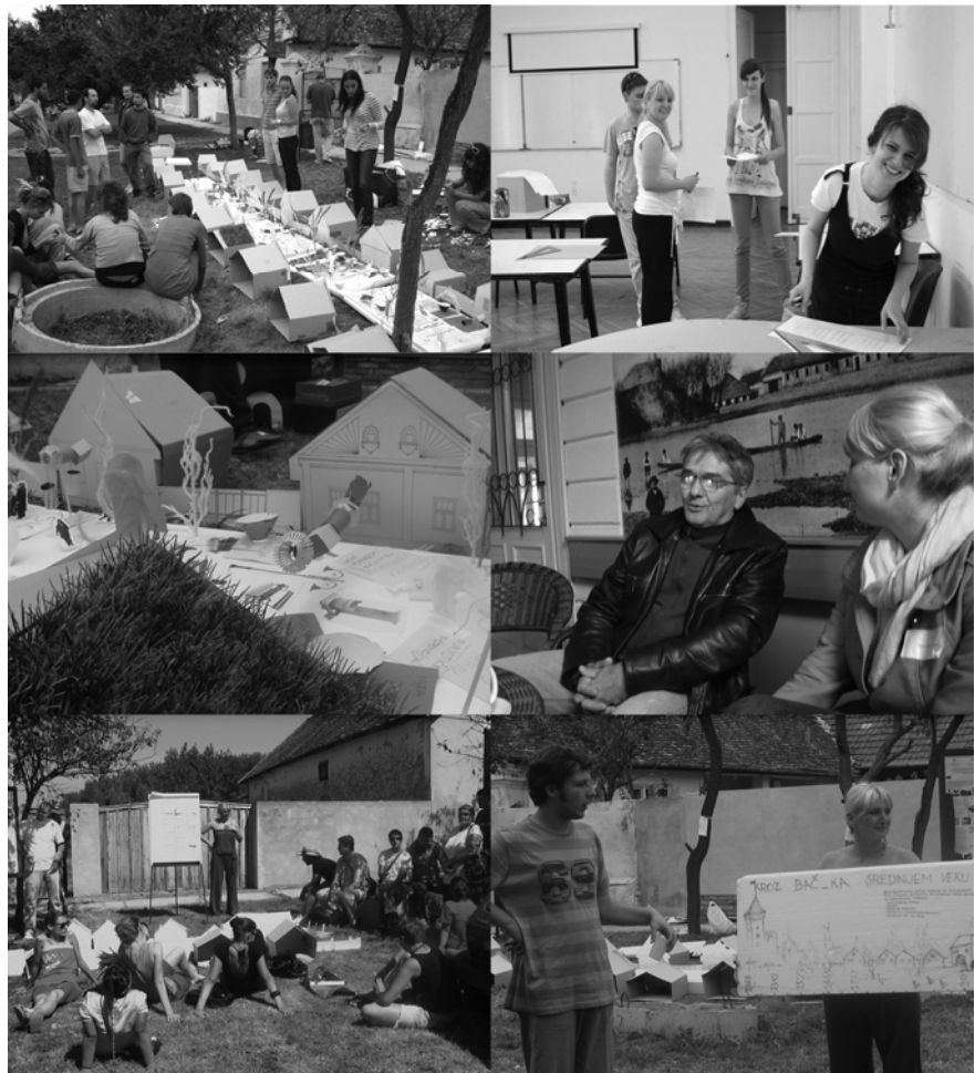
Figure 2: Process of developing soft infrastructure using 'Integrative urban design game.' Photo archive of the 'Workshop: Participative Approach in Design of Public Space of Bač Fortress Street, 2010'

presentations, drafts, drawings, and text, as well as different expert methods of polling, interviewing, context analyses, morphological analyses, and collaborative methods that support argumentation (different diagrams such as problem tree and tree of aims and measures). The essence of the method was establishment of 'soft infrastructure' and integration between different types of rationality, as well as between the phases of the regeneration process (Figures 2 and 3). The assessment regarding the level of developed soft