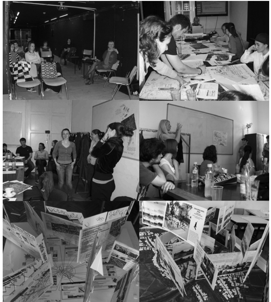
Figure 3: Process of developing soft infrastructure using 'Integrative urban design game.' Photo archive of the 'Workshop: Integrative Urban Design in Urban Regeneration of Bač Settlement, 2011'

However, 92.86% saw a lack of knowledge regarding contemporary approaches to urban design and urban regeneration as the main obstacle for implementation of the method in Bač community. Only a few of them (7.14%) partly believed that resistance to change could be an obstacle. According to previously presented report, I conclude that the method provides development of soft infrastructure.