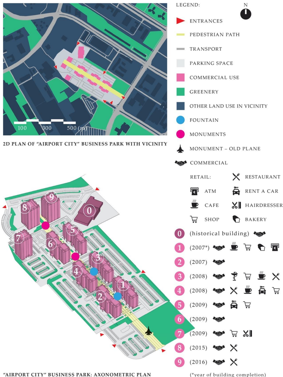
Figure 3. “Airport City” Business Park, state for 2020: (above) the complex and vicinity; (below) the internal organization and axonometric plan of the business park (Author: V. Parežanin, 2020).

summer; thus, all café gardens along this side are with parasols and sunshades. All open spaces are equipped with high-quality furnishings that are well maintained. They differ in design, urban furniture, and pavement.