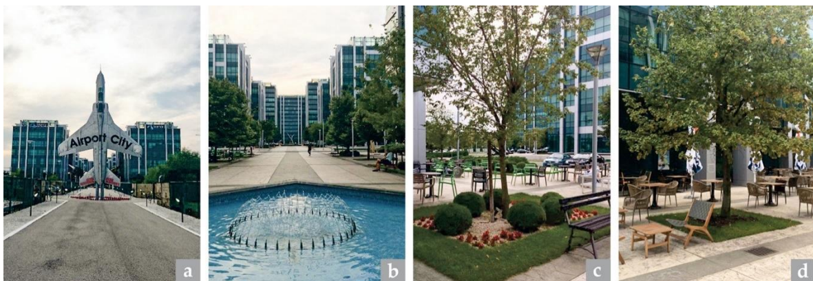
Figure 1. “Airport City” Business Park in Belgrade, Serbia: (a) general view on the business park; (b) the main plaza—a key public space within the park; (c) greenery and gardens within the business park; (d) greenery and urban furniture within the business park.

Part A: According to recent studies there are several techniques for measuring the WSL, such as self-reports, behavioral measures, and medical-biological measures [21,25,85]. In this particular research, we opted for obtaining self-reports of the stress-related experience using PSS. The PSS is a widely used psychological instrument for measuring the perception of stress, often used within behavioral medicine research, with questions that are easy to comprehend and are not related to a specific group of stressors and strains, or a specific category of users [16,25]. The scale consists of 10 questions where the respondents