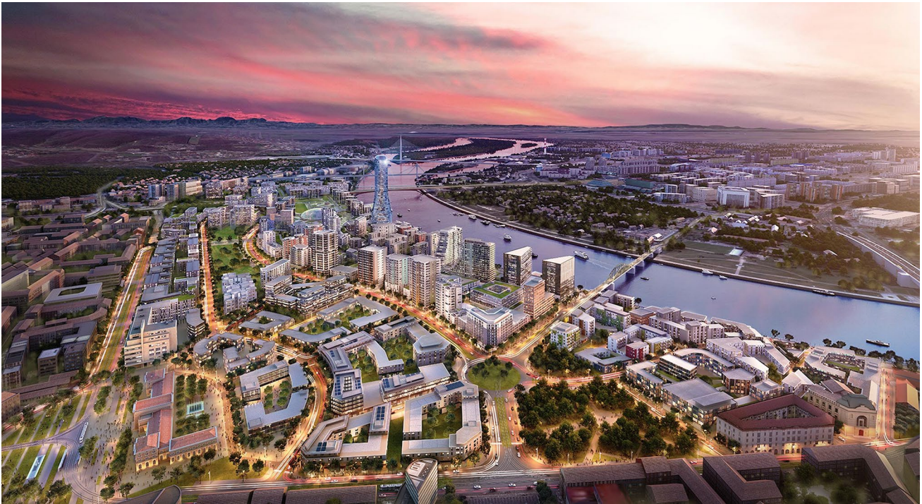
Fig. 5 Belgrade Waterfront—a model.

CB 70/2014) were verified in September 2014 (Cukic et al. 2015; Peric 2020b). Despite this, the civil sector continued with public discussions. Through the open debate with academics “What is hidden beneath the surface of the ‘Belgrade Waterfront’” in October 2014 parallelly to the spatial plan making procedure and the creative performance “Operation lifebelt” in November 2014 during the public meeting on the approval of the Plan for the Area of Specific Use, the activists tried to attend to the shortcomings as presented in the plan. Again, the political structures embodied in the planning commission stayed ‘deaf’ to the citizens’ calls resulting in the adoption of the preliminary version of the spatial plan two months later, thus excluding all public remarks (Cukic and Peric 2019; Peric 2020b). Even after the start of construction of the BW project in September 2015, citizens regularly organized the protests in 2016 and 2017. The public revolt, however, did not prevent the further development of the area. Currently (2020), several housing objects, a shopping mall, a great deal of road infrastructure and public open spaces have been finalized and open for public.