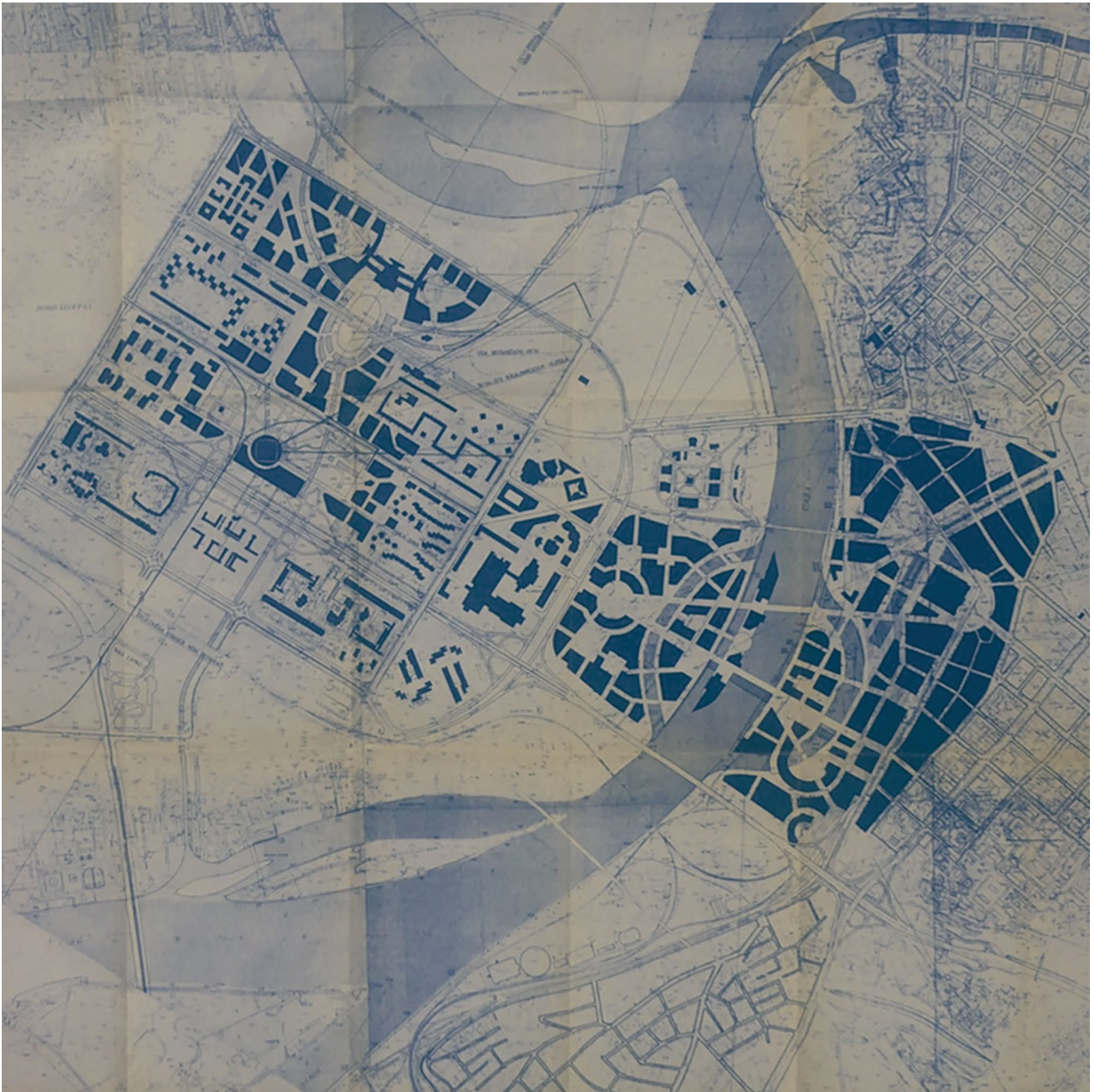
Fig. 4 The town on water.

by the Republic Agency for Spatial Planning (RASP) in full accordance to the BW Masterplan. However, the planning law from December 2014 (OG RS 132/14) revoked the RASP and appointed the Serbian Ministry of Construction, Transport and Infrastructure as a body in charge of the further plan development. The spatial plan of Belgrade Waterfront (OG RS 7/2015) was adopted in January 2015.