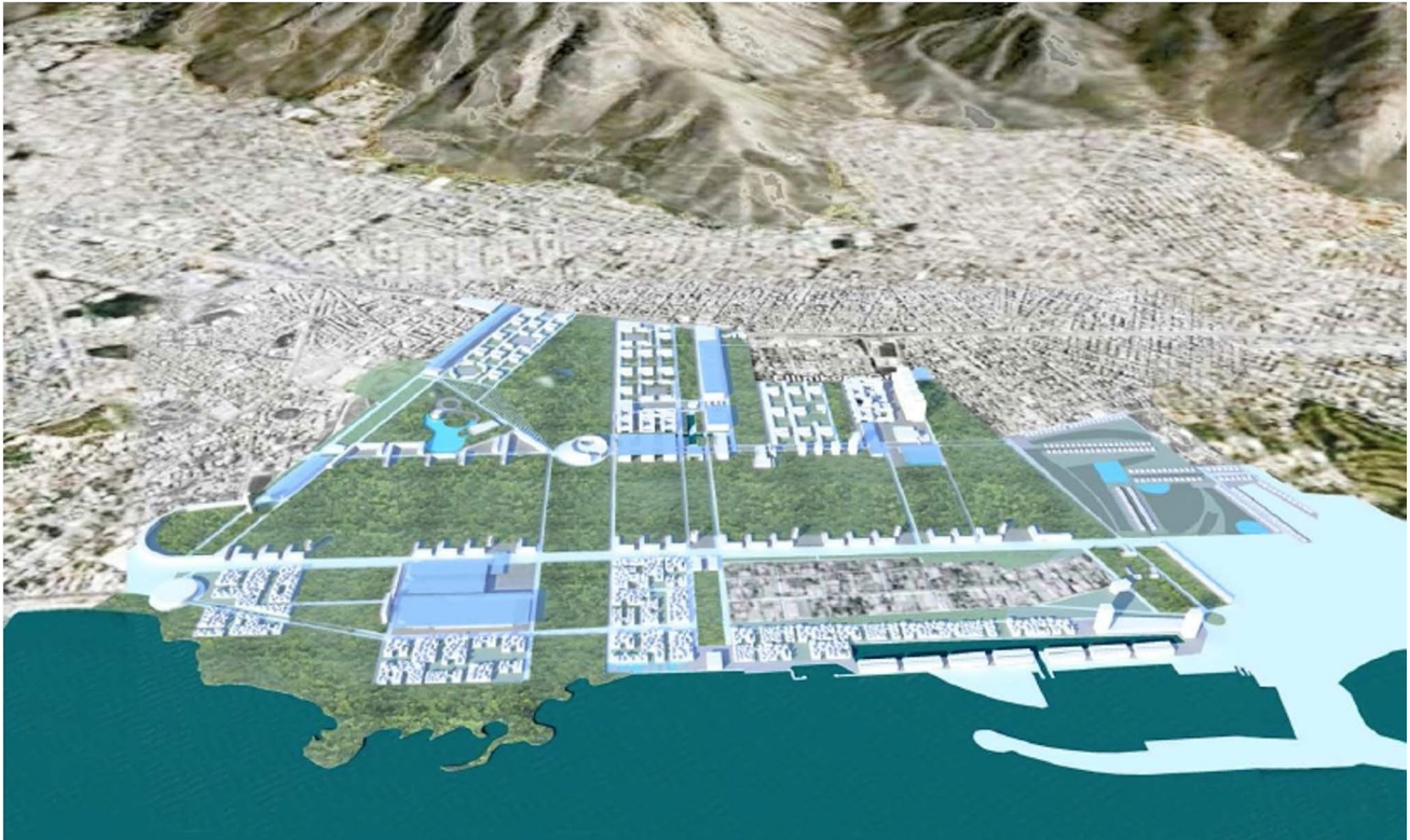
Fig. 6 Hellinikon strategic urban model.

(Pappas cited in Papamichail and Peric 2018, p. 335). As a result, professionals cannot do much to restrict close feedback between developers and politicians, hence, repeatedly posing crises for effective spatial development (Papamichail and Peric 2018; Komninos 2014; Zifou 2015).