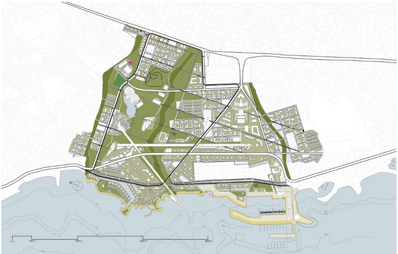
Fig. 8 Masterplan—urban development model.