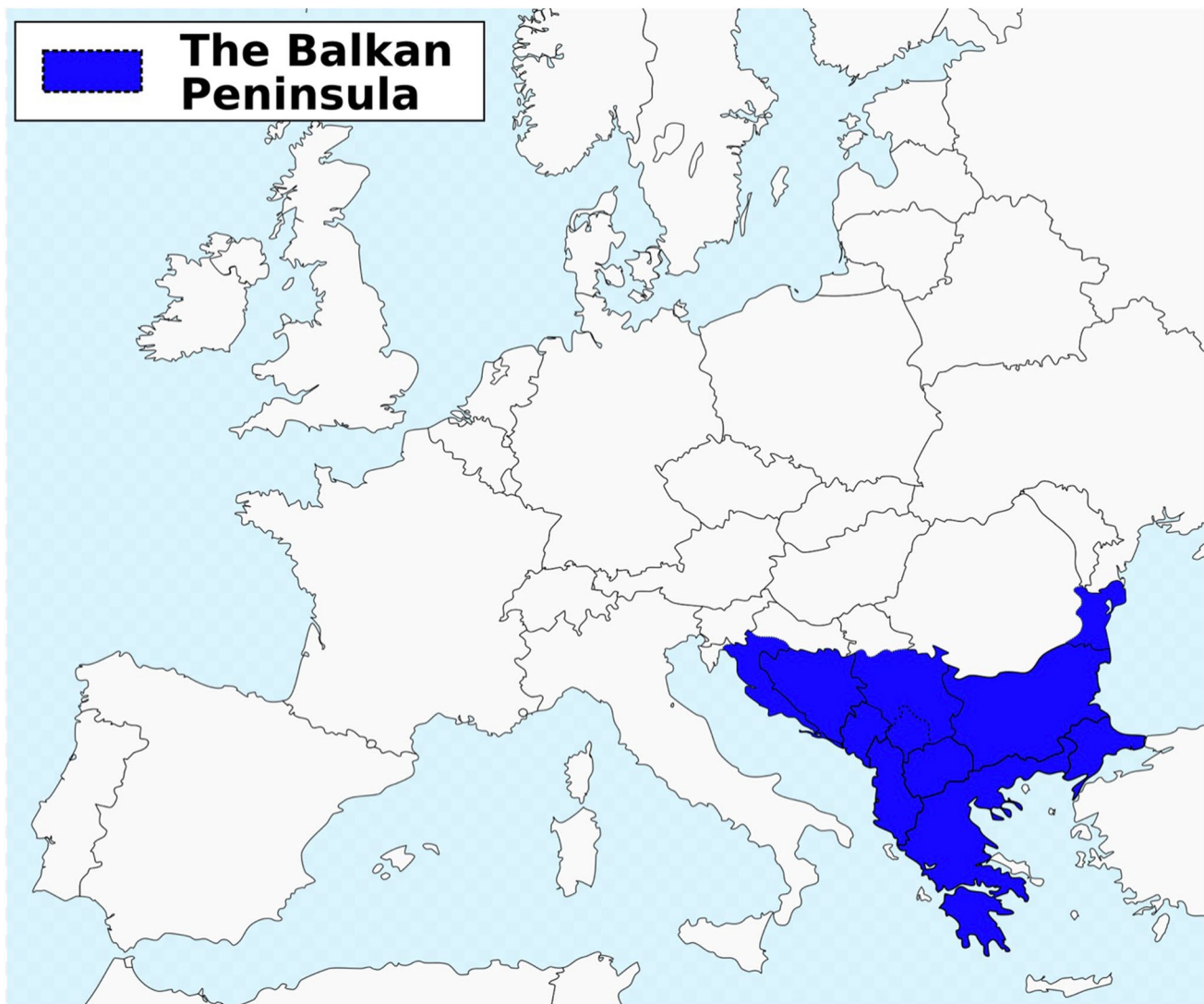
Fig. 1 The Balkan Peninsula in Europe.

Bulgaria), as well as the communist Albania influenced by China. The fall of the Berlin Wall together with the rise of nationalist tendencies in the federal states of Yugoslavia led to the dissolution of the country. However, the consequences were felt throughout the region highlighting again the ethnic factors. On the one hand, Greece saw the Former Yugoslav Republic of Macedonia as a historical, political and security threat, which was dissolved almost thirty years later when the new state name of North Macedonia was coined in 2019. On the other hand, the position of the Albanians living in the diverse parts of former Yugoslavia and Greece was strongly affected as they gained political significance.