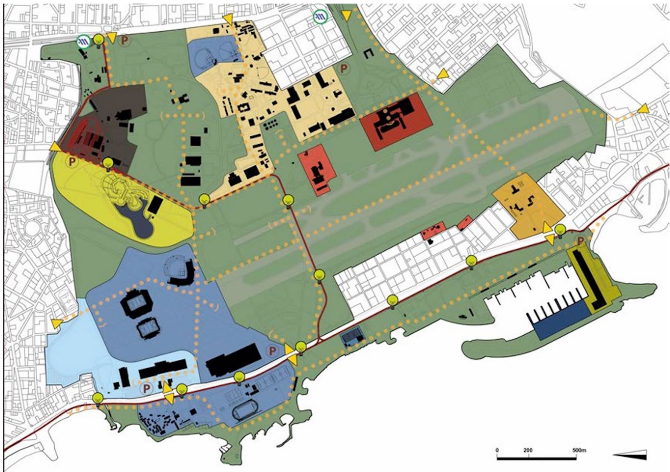
Fig. 7 General master plan of Hellinikon Metropolitan Green Park.

(2015–2019) prevented foreign businesses from operating in Greece; nevertheless, immediately after centre-rightist New Democracy won the elections in July 2019, the new prime minister promised to accelerate the Hellinikon development (National Herald 2019; Kampouris 2019). In a meantime, Lamda engaged Foster and Partners to provide a design for the future ‘new city’ within the Athens metropolitan area, comprising business, retail, and residential districts, art venues, a metropolitan park of 200 ha, and a revitalised public coastline of 3.5 km (Fig. 9). The area will host 40,000 residents and generate 75,000 jobs. The total costs are foreseen to 8 billion euros, with the implementation period set to 2045 (The Hellinikon Project 2020).