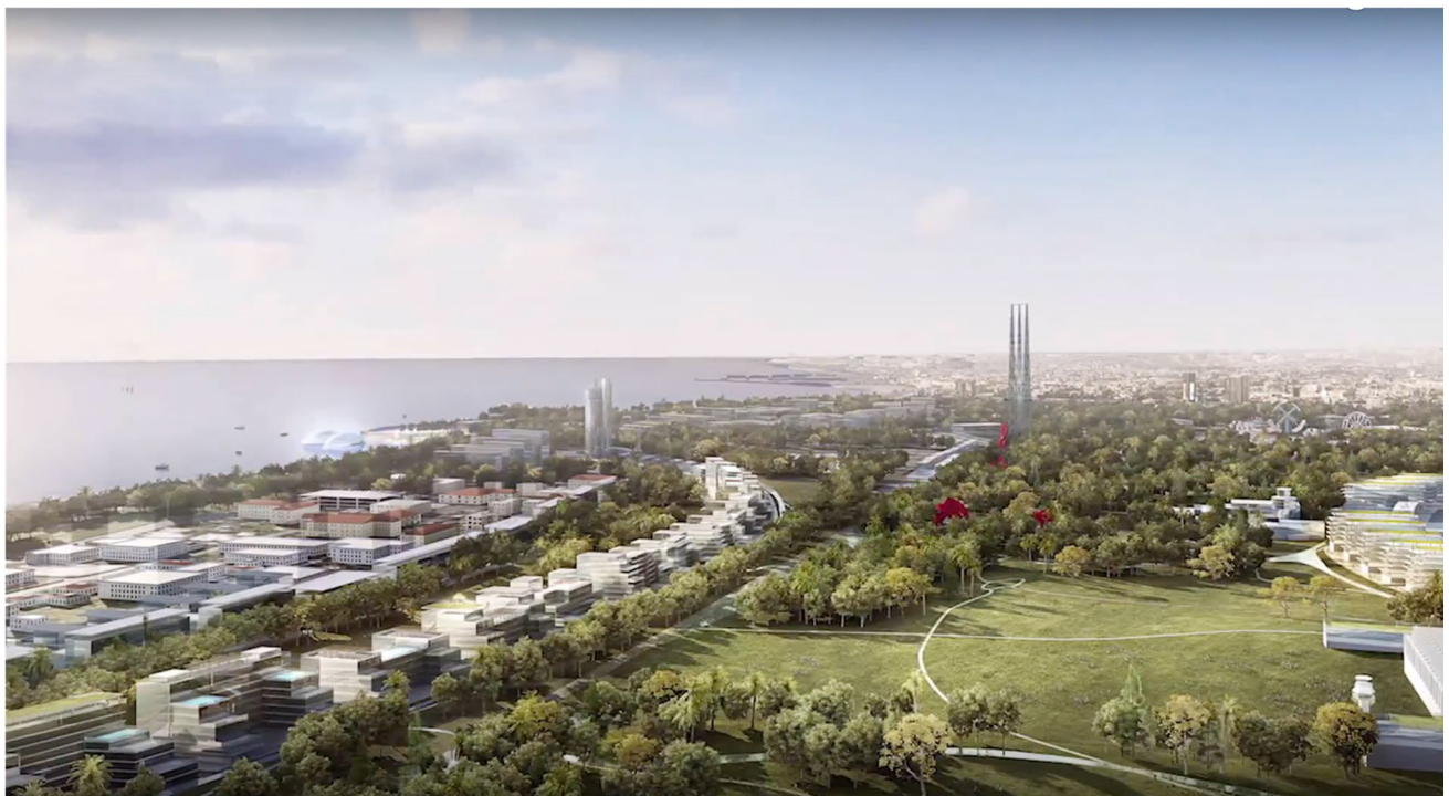
Fig. 9 The model of the Hellinikon project.