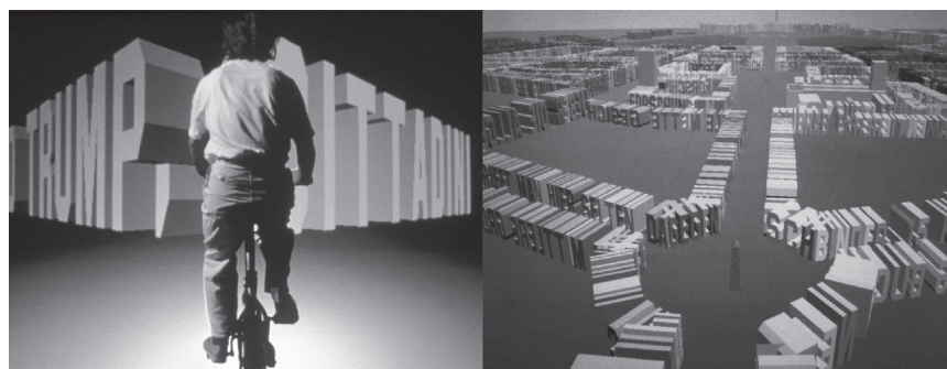
Figure 1. Jeffrey Shaw, The Legible City , New York, 1989; Amsterdam, 1990; Karlsruhe, 1991. (Source: http://www.jeffreyshawcompendium.com/portfolio/legible-city/ (accessed: 06.05.2017))

If we discuss types of screen media environments, we can start with screen media interfaces in space, which are the oldest form to use screens as architectural elements in space. In screen media interfaces, usual modalities of screen used are video installations of large proportions or multiple projections, whose goal is to create an effect of telepresence and augmented or composite reality. The matter of scale is important in creating an effect of immersion. If the scale of the screen and media content it presents correspond to the real life scale, the effect of immersion into parallel world is stronger. On the other hand, some of the examples of screen interfaces in practice don’t have a scale, or to say, can be scalable in space. The usual questions that these types of environments explore are navigational models of space, human-machine motion capture and interaction, distributed and networked models of space, transit of information, and relationship between data, virtual and real space realms. Many examples of practice explore exactly the question of the balance between virtual and real space realms, as well as methods through which this balance can be designed. These explorations are treating an issue of space boundaries as well.