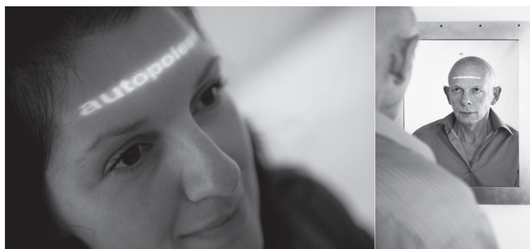
Figure 3. Rafael Lozano-Hemmer, Autopoiesis , Manchester Art Gallery, Manchester, 2010. (Source: http://www.lozano-hemmer.com/autopoiesis.php (accessed: 06.05.2017))

Also, an interesting example of screen interface use in space is De-Viewer (1992) by ART+COM Studios. In this intervention they play with the prejudices we have about screens. They put a classic art painting by Giovanni Francesco Caroto on the wall, but when viewer draws attention and holds eye focus on some specific detail of the picture, that area of picture starts to decompose into pixels. In this way ART+COM plays with the expectations of a viewer, making classical screen behave like digital, real-time and a responsive one. In terms of architecture these kinds of works have introduced ideas of responsive and mutable surfaces in architecture, which can behave as nonstandard technologies – in variable and customised way.