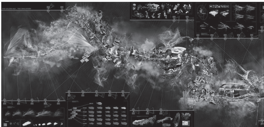
Figure 5. Paul Nicholls, Golden Age-Simulation , Chronogram, Mentor Nic Clear, Bartlett School of Architecture, Unit 15, 2011.