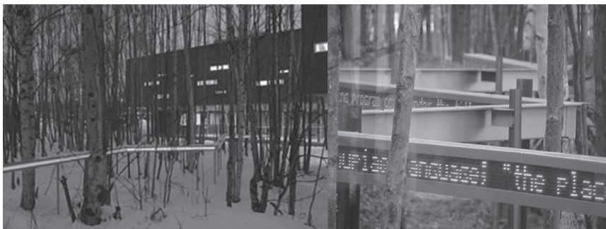
Figure 2. Ben Rubin, Story Pipeline , BP Energy Centre, Anchorage, Alaska, 2002.

There are examples of practice that are highly experimental, but could be considered as an architectural intervention in space, since they carry architectural potential and create powerful influence on perception of space. In the age