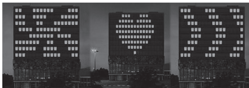
Figure 7. Chaos Computer Club, Blinkenlights, Berlin, 2001.