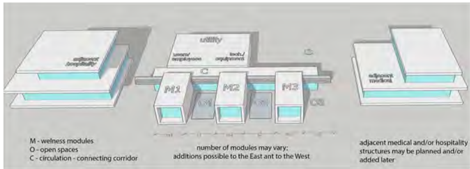
_ Figure 1: Model for modular wellness facilities