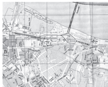
Fig. 5. Belgrade, 1930.