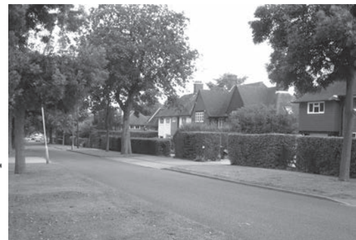
Fig. 2. Dwelling Quarters, Letchworth