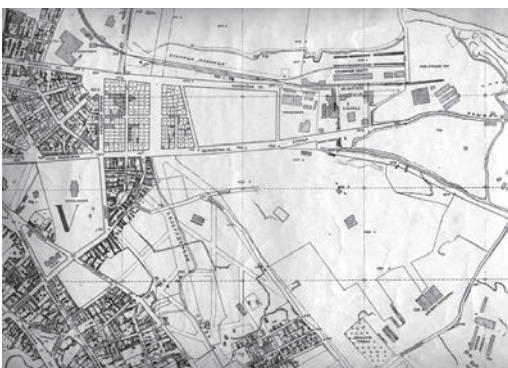
Fig. 4. Belgrade, 1921.