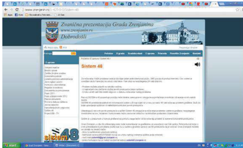
Fig. 3: City of Zrenjanin, web-presentation: 'System 48' - a user-friendly service of e-government, which enables interaction between citizens and all institution founded by the city.

The city of Zrenjanin has also established a mode of e-government. The web-site of the city administration includes a section related to planning documents containing all levels of plans - from the Regional and Master plan, to the plans of general and detail regulation of urban zones. The documents (textual files and drawings) could be downloaded from the site by all interested parties. The site also incorporates two interesting services - 'The office of quick responses' and 'System 48'. The first one provides information about urban sites/locations, including the data about potentials and limitations of a particular building lot, defined by the planning documents. The 'System 48' is used for communal problems, which could be reported by phone, text messages or Internet. It interlinks services of all public institutions founded by the city of Zrenjanin, enabling efficient response to identified urban problems and demands of citizens, as well as facilitating their solution. The system is active non-stop and within 48 hours all users receive a status report about the activities related to the problem.