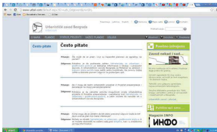
Fig. 2: Town Planning Institute of Belgrade, web-site: frequently asked questions related to different aspects/problems of urban development (e.g. planned activities and capacities, procedures, public presentations of plans etc.)

During the preparation of the Master plan of Belgrade in 2003, public participation was also included into the first phase of the process. The conceptual phase used the method of 'random participation', targeting all interested parties. Several hundreds of Belgrade citizens communicated with a special team in charge for the preparation of Master plan, using various media - from phone calls, to emails. After the completion of the second phase (and before the official approval of the plan), citizens also participated in the public meeting which gave them a detail insight into the document. Although majority of citizens were mostly interested in small-scale interventions i.e. a level of their own lot or building, approximately one-fifth of the present citizens was interested in the problems of public good, giving a number of useful ideas and suggestions related to crucial urban issues - green network, urban infrastructure, main bridges, articulation of river banks, protection of certain areas and buildings, quality of the environment.