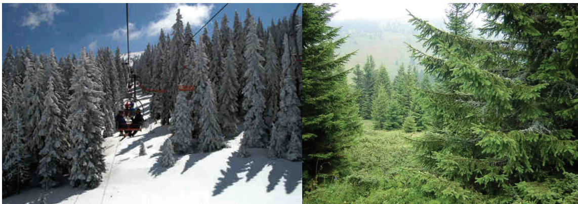
Fig. 1: Natural beauties of Kopaonik mountain