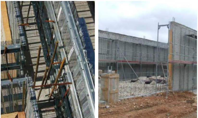
Figure 7. The system of integrated metal formwork.

A system that can be interpreted as integration of the principle of formation and functioning of two previously considered composite systems, is a system based on joint work of ferrocement, steel members and conventional reinforced concrete (Figure 7). It is a system of integrated metal formwork, which can be used for realization of low-rise and high-rise buildings (Rešenjazaenergetskuefikasnost, 2013). This system was applied within Olembe housing program, led by the Public Real Estate Company of Cameroon in the capital Yaoundé. They required quality, cost-efficient structural solution that allow fast construction. The system of stay-in-place steel formwork was the solution that answered their needs (Innovative Solutions for Construction, 2013).