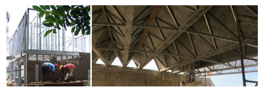
Figure 5. Construction of building in Am-cor system. Figure 6. Folded roof structure formed as composite assemblie.

The folded roof structure that spans 22 m, created by Mendez Baeza in Yucatan, is also based on the composite action of ferrocement and steel (Figure 6). The structure is formed as composite assemblie of steel trusses and ferrocement membrane. The galvanized reinforcing meshes are attached to the skeletal reinforcement, which is previously attached to the upper side of the steel trusses. The mortar in a layer of 2 cm is applied on the reinforcing meshes.