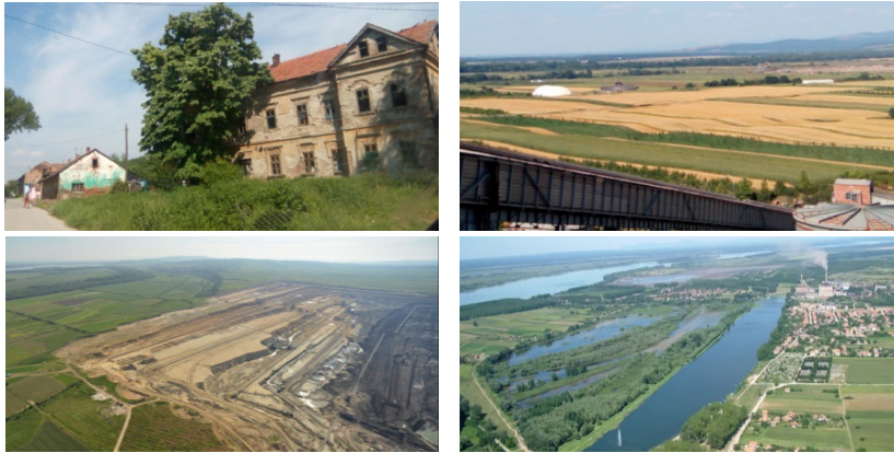
Figure 1: Mining colony in Stari Kostolac, a view to Viminacium from the power plant “Kostolac B”; Kostolac town; coal mine “Drmno”.