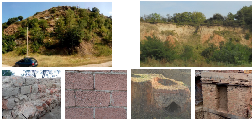
Figure 2: Ram stone quarry, crvenka quarry, brick kilns from Viminacium , brick kiln in a present day village near Viminacium, Viminacium wall made of crvenka , modern blocks made with crvenka

area of the Vajfert mine. Soon after, it was closed because it could not compete with small rural manufacturers (Marković 1971). Today, brick factories in the Požarevac area are abandoned and only one rural workshop makes products for further distribution, exporting products to many European countries (Cotto Rustico 2015). This traditional skill is an important immaterial heritage of the area and every attempt should be made to try and preserve it. Recording the old closed workshops in the area and buildings that were built with this product, along with education of young people in villages by old masters and their encouragement in business development, can be part of this process.