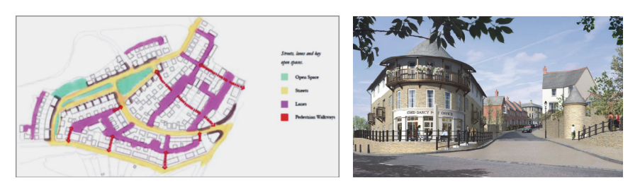
Figures 2, 3: Coed Darcy: Village plan and characteristic view