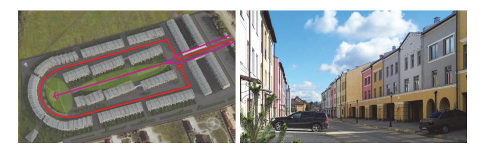
Figures 4, 5: Ivakino-Pokrovskoye: Village plan and characteristic view