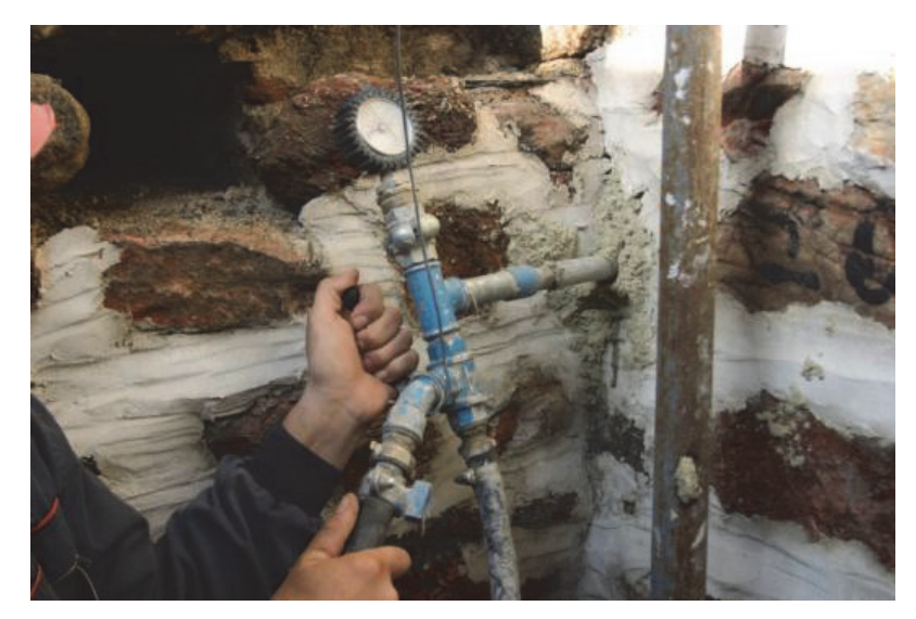
Figure 3. Injecting the injection mixture into a wall, using a nuzzle consisting of a manometer and a three-way valve that is used for returning unused mortar inejction into a tank – mortar injection recirculation