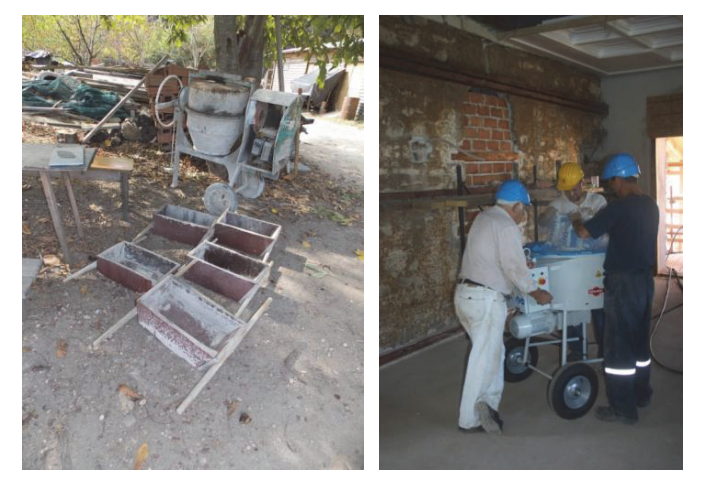
Figure 1. Mortar mixers for making injection mortar: a) standard rotating drum mixer and volumetric measure for determining the ratio of material, 6) planetary mortar mixer without a rotating drum

The cement-based injections without lime are only applied to the area that contained wooden construction – santrač, which was burned or rotted, and standard steel reinforcement bars were placed instead. The cement-based injections without lime are also applied to those places where steel profiles were installed in order to provide additional wall strengthening. If the method of wall strengthening is ensured by stainless steel reinforcement, cement and lime-based injections can be applied.