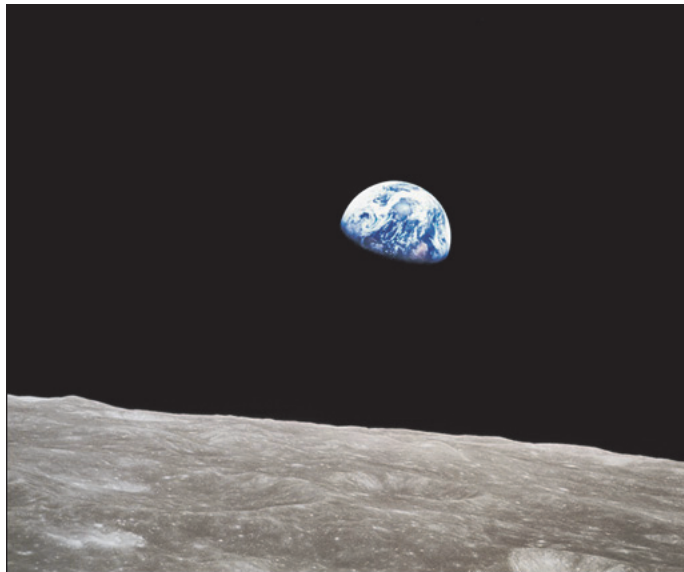
Figure 65: Earthrise - photograph by William Anders, NASA, 1968.

Modernists placed great importance on the aerial view. Their relationship with zenithal perspective was described by Nadar 256 , creator of the very first aerial photograph, who said that cities and landscapes, from above, look like a toy-land, inviting one to play 257 . Modernists assigned a negative connotation to the aerial view, as it depicted urban disorder, but at the same time they saw the aerial view as a perfect tool for this chaos to be arranged and controlled.