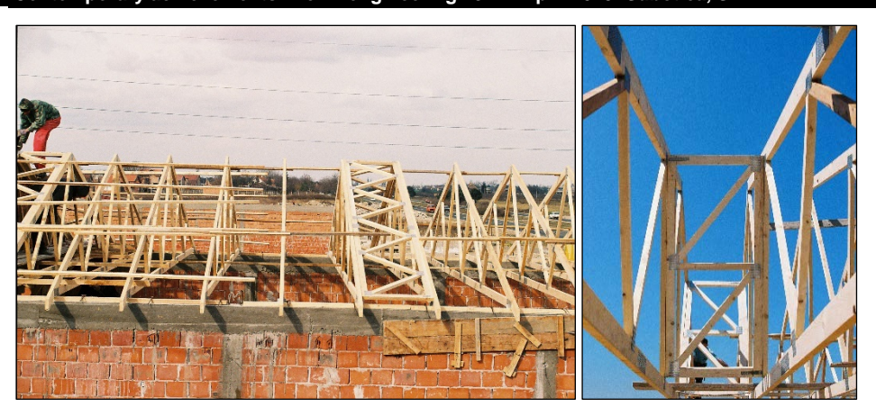
Figure 2. Lateral bracing frame