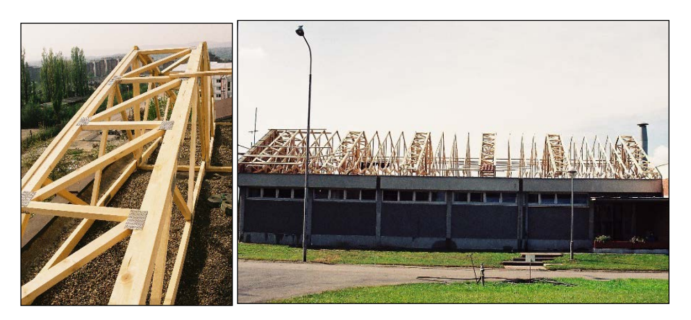
Figure 1. Lateral wind bracing

Lateral wind bracing represents transverse roof bracing (Figure 1). They are positioned in plane of the upper chords with the task of accepting the wind load that is perpendicular at the plane of the basic lightweight roof girders. Lateral bracing frame has the task of providing lateral supporting points for the chords of the basic lightweight roof girders that are loaded axially with force of pressure, and in that case the lateral wind bracing has the role of lateral bracing frame. In fields without roof bracing, the side supports of the upper chord are achieved by placing wooden battens that transmit the load to adjacent bracings (Figure 2 - left). Web members in which the permissible slenderness is exceeded for the reference width of the cross-section, must have lateral supporting points at half its length. This is done by setting up the lateral bracing in the plane of two web members, between the two basic lightweight roof girders (Figure 2 - right). A wooden batten, with the minimum dimensions of the cross-section 5/5 cm, is placed between them, and it connects the adjacent bracings and web members at half their length. The position of the lateral bracings for the single and double-deck roof has been shown in Figure 3 [3].