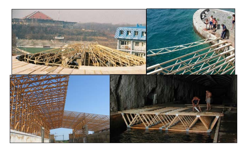
Figure 5. Girders with the supports on the same (left) and at different heights (right)