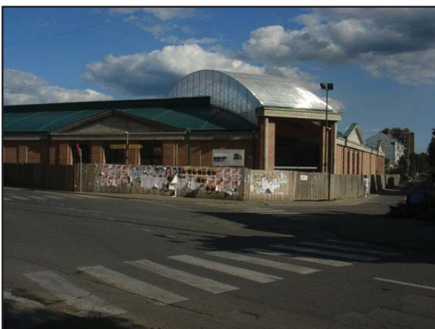
Figure 3. Sirmijum, Visitors center

In last several years a particular attention is paid to organization and presentation of a part of Imperial Palace. The remnants of the palace are covered by a permanent structure, opened for visitors in the 2009. This new building, beside the protection, has a function of a Visitors' center also. The center include a gallery for selling souvenirs and publications, wardrobe, coffee bar, official block for personal, depots and pantry, as well the rooms for custodians. Construction of the building is realized by laminated wood. Above archeological remnants there is a light steel construction, with trails for visitors, enabling full view of the site in the whole [7] (Figure3 and Figure 4).