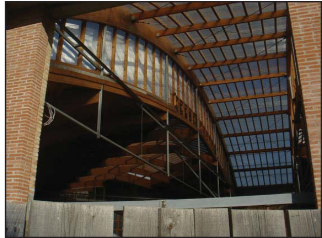
Figure 4. Sirmijum, Visitors center construction