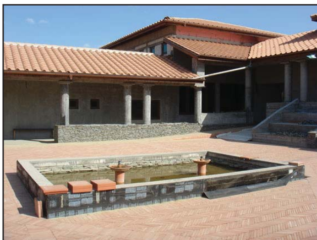
Figure 1. Viminacium, Visitorscenter atrium

The Rustic villa is a new building at the archeological site. This building or Viminacijum center has a multiple function, in commercial and scientific sense. It is a component of the complex, beside the roman settlement and military camp. The Viminacijum center is imagined as a place which enable gathering of business and intellectual elite in an ambient of old roman city and military camp. In other days it will be open to visitors and tourists. It means that the Center will have several levels: scientific and research, education, marketing, all in function to promote the Center as an attractive scientific and tourist loca-