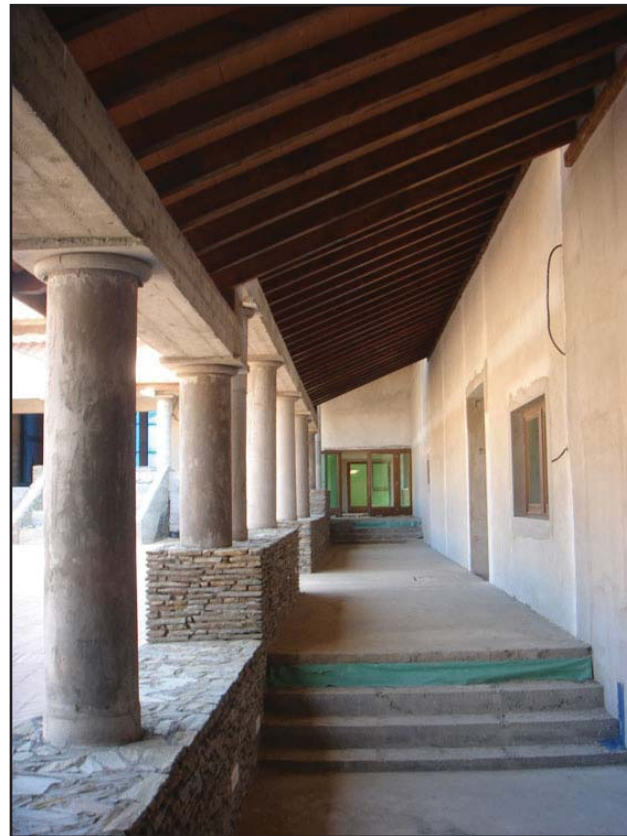
Figure 2. Viminacium, Visitorscenter atrium

tion. It will be organized around seven atriums. It will have laboratories for scientific investigations, accommodation capacities and necessary economic and service part (Figure 1 and Figure 2).