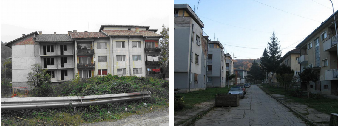
Picture 3 - Housed and unfinished collective residential building in Ciprene - Bulgaria and group of collective buildings in Kalna – Serbia

The aesthetic value of architecture and created environments in villages on the Bulgarian side is uniform, without major fluctuations, which are in Serbia in the lower regions abound, even commonplace. The architecture of the village in a very hilly and mountainous areas, at a greater distance from the base of the main roads on the Serbian side is more uniform aesthetic value. In Serbia, there was less investments in buildings, the period of them construction is older, but due to less influence of standardized and poorly designed projects and facilities, a higher degree of indigenous folk works, spontaneity and rationality of the architectural process, preserve the ambience of a traditional village and the tameness of rural areas. The complete opposite of this are the villages at the foot of the mountain, near the main roads where existing the incidence of inadequate housing facilities which moustly visibly distorts the rural landscape.