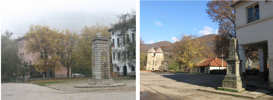
Picture 1 - The center of village Rakovica (Bulgaria) with "Reading room" - "Čitalište" and admistration - "Kmetstvo" (left), and the center of the village Donja Kamenica (Serbia) with the Church (14th century), City Office and the Cooperative house (right)

Bulgarian villages consisted of both facilities for culture to the fullest extent, which are massively built after World War II. As the building with a specific function, were achievement of socialism and their role was backbone of future socio - cultural development of the village. They were built in both cases on the basis of model projects, and their capacity is dependent on the size of settlements for which they are planned.