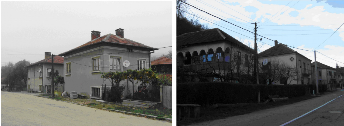
Picture 2 - Double houses for workers by standardized projects in Bulgaria - Rakovica (left) and the diversity and colorful in form of houses in Serbia - Kalna (right)

built flats for workers. Degradation of that superstructure, from the viewpoint of possible repurposing, are extremely unfavorable circumstances.