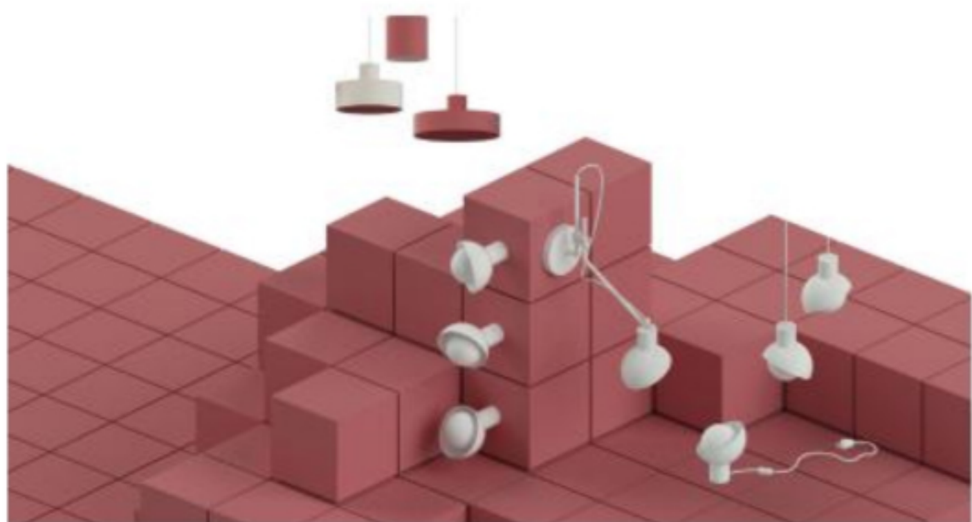
METEOR STUDIO M interior lighting system

IVANA RAKONJAC MILICA OTAŠEVIĆ BORISLAVA IVANKOVIĆ Belgrade, Serbia