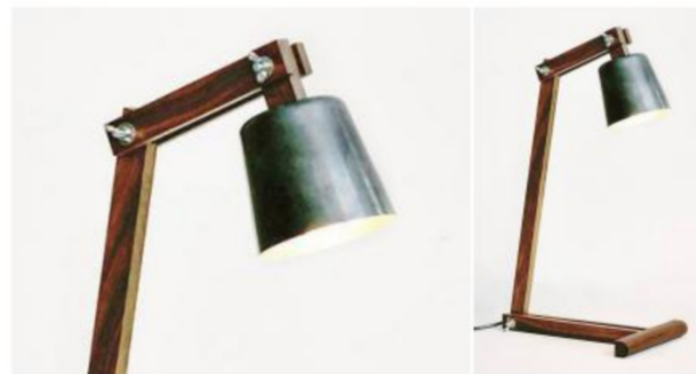
LAMPMM Lamp Orlando