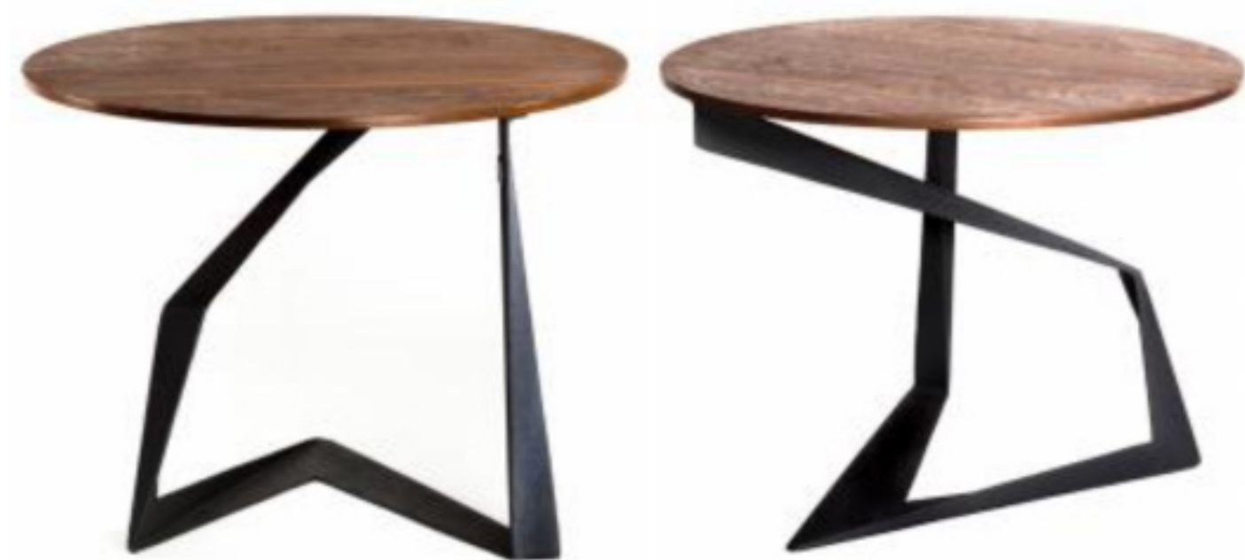
IVA ĐUROVIĆ Forma 01