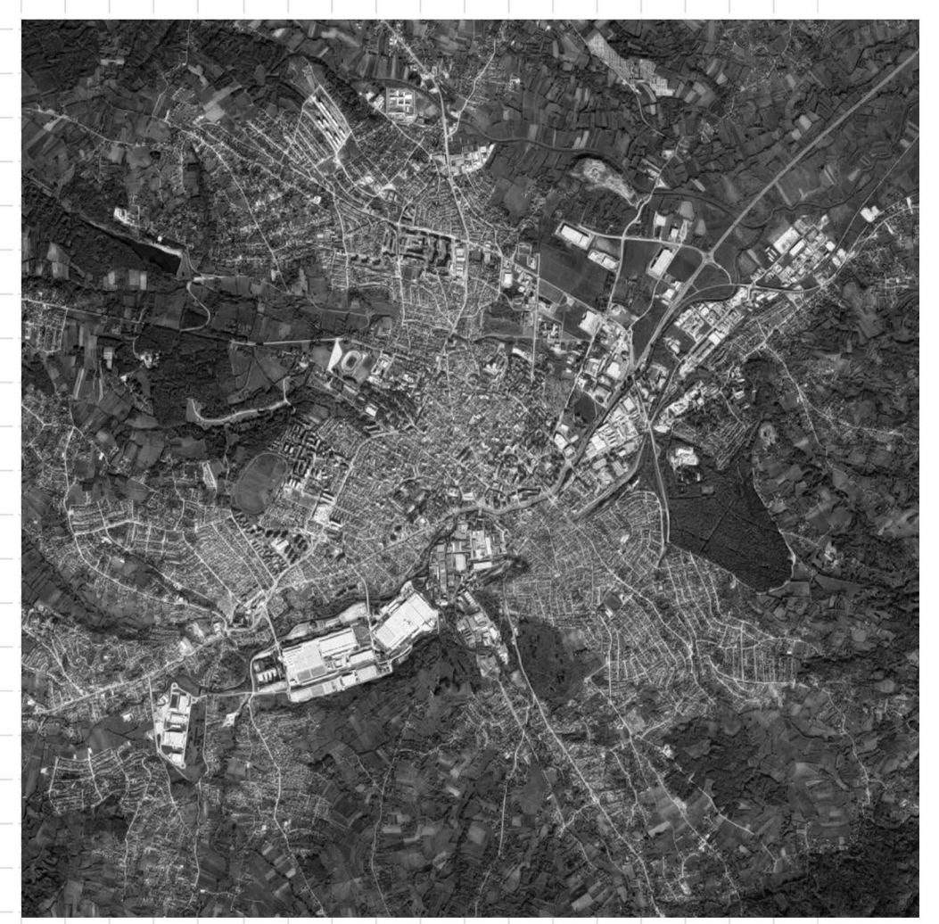
City of Kragujevac - Satellite image

Keywords: periphery, unbuilt, narrative spatial analytics marginal spaces, urban nature