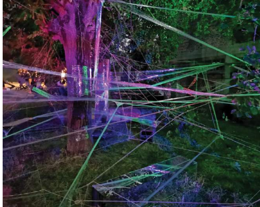
ee02 AUTORI_AUTHORS Milena Grbić i Nevena Balalić NAZIV DELA PROJECT TITLE ROMSKA KUĆA _ KORAK PO KORAK: jedna mogućnost // ROMA HOUSE _ STEP BY STEP: One possibility GODINA PROJEKTOVANJA_YEAR OF DESIGN 2020