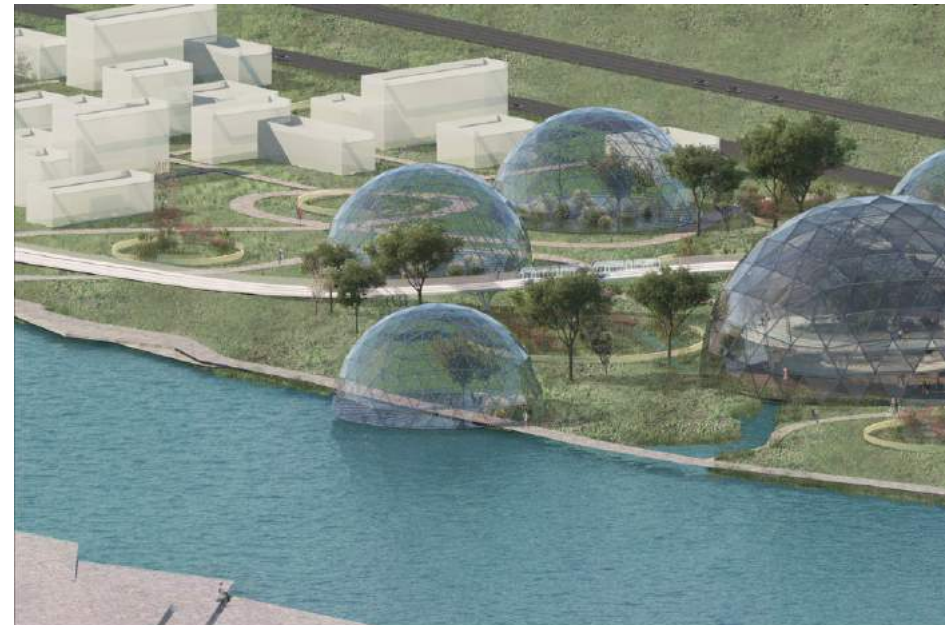
kc36 AUTORI_AUTHORS Darija Rašeta, Vanja Spasenović NAZIV DELA_PROJECT TITLE Rečni kvart Zenica // River Block and Walk Zenica LOKACIJA DELA_PROJECT LOCATION Zenica, Republika Srpska, BiH // Zenica, Srpska Republic, Bosnia and Herzegovina GODINA PROJEKTOVANJA_YEAR OF DESIGN 2019