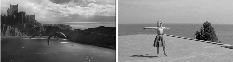
Frame 3. Game of Thrones “Dragonstone” (Season 07 Episode 01). Jeremy Podeswa. 2017. 00:50:08

to the formal organization - elongated proportions, thin walls, almost curved garlands - that creates and radiates white light with a high frequency of flickers. Horizontals sink into the ground, while the dome and the bell tower merge with the sky inside, and the niches, the interlacings, reduced plastic and garlands evoke the vibrant luminism of the last Byzantine renaissance.