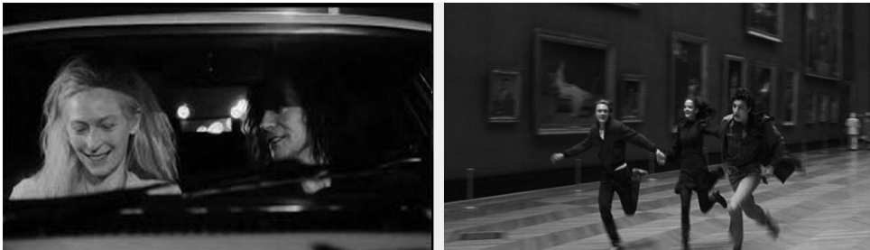
Frame 1. Only Lovers Left Alive. Jim Jarmusch. 2013. 01:04:54

making it entirely from translucent glass, in order to make it seem more ephemeral, weightless, as the basic element of architecture entering the weightless state, revealing the modern gap between individual and civilization, the tension towards the personal and subjective experience, as opposed to the objective certainty of mathematical reason. At the same time, the loss of mass signifies the loss of the center, the decline of perspective, the escape of figures in space and time, the unstoppable opening and disappearing in the depth of the vault without objects. This is the iconic equivalent of the necessary eccentricity of the modern man's place of existence. ( Frame 1 )