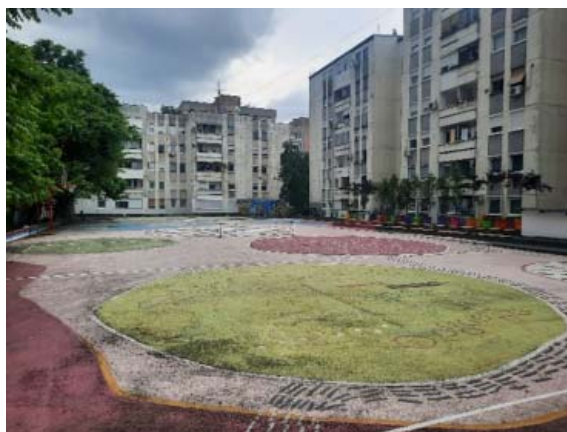
Figure 2: "Građiš" as "Citrus Park"

Meanwhile, new Regulation plan of part of the central area of Banjaluka was adopted in 2018. The playground on the Građiš site is finally planned by this implementation document, which was principal goal of community-based initiative. However, the plan envisages the construction of a large high-rise residential complex on the neighbouring plot, which, in the opinion of this community representatives, would additionally impair the quality of life in this settlement. Due to the formal irregularities in the adoption of this plan and based on the initiative of the residents of this settlement, the Constitutional Court of the Republic of Srpska declared the Decision on the adoption of the plan unconstitutional. This means that the Regulation Plan from 2007 is still in force.