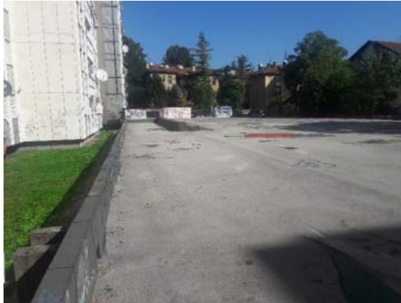
Figure 2: “Građiš” as the roof of the underground bomb shelter

Community-based initiative “Građiš” is a decade-long initiative for preservation of open public place located on the roof of the underground bomb shelter in Sime Šolaje Street in city centre in Banjaluka. This public place popularly named “Građiš” or “Građa” has been an improvised children’s playground in a residential neighbourhood for decades. Even it was just a concrete surface and didn’t look like playground from picture books with greenery and swings, it was the only playground they had (figure 2).