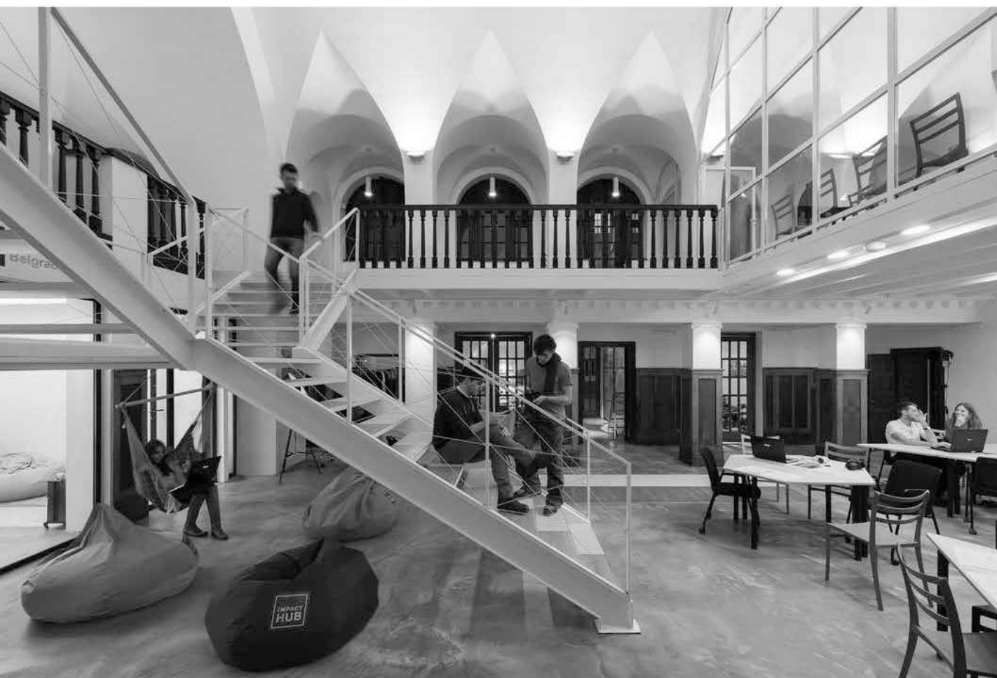
► Impact Hub Belgrade _ enterijer poslovnog prostora / Impact Hub Belgrade _business space interior