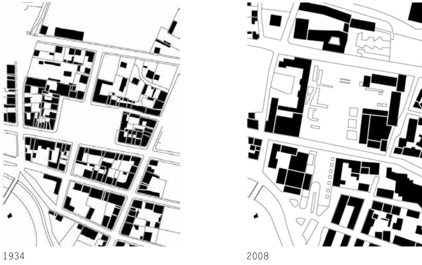
Figure 4. Užice town square transformation (V. Djokić, p.214, p.215)