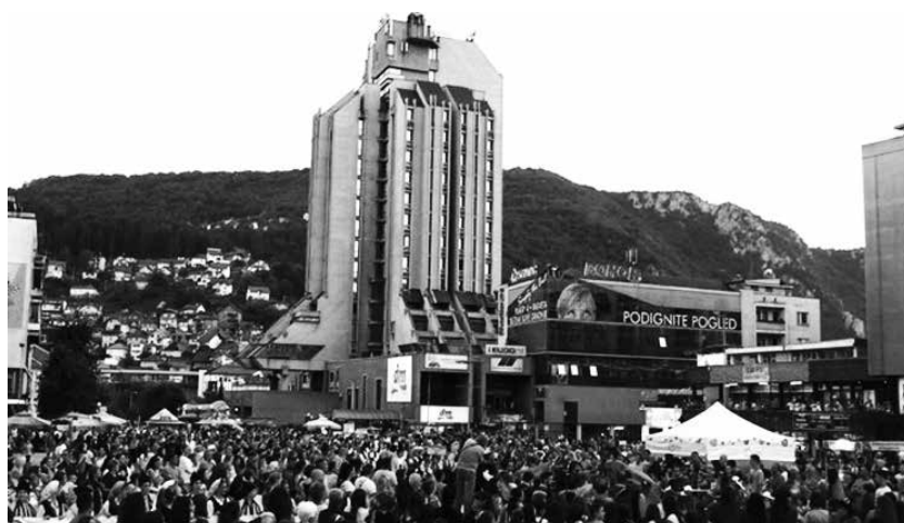
Figure 8. Užice, International Children's Folklore Festival "Licidersko srce". August, 2016 ( https://goo.gl/images/A6mMyK )

6. ACCESS . The principle of adequate access to the space refers to the level of simplicity in approaching the square. The best squares are easily accessible to pedestrians, that is, the streets that lead into it are narrow, crosswalks are clearly marked, the duration of green crossing lights is adapted to pedestrians (not cars), traffic is slowed down, and transport stops are located nearby. If the square is blocked off by a bigger street, it would cut off foot traffic, depriving it of its most basic element: users of space. The access to the space can be seen in another way: adequate planning of the position and number of parking spots strongly influences the access to the space. Further, by careful planning of bike and public transportation lanes/pathways, we increase the level of access to the space and of course its acceptance.