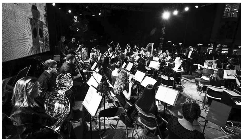
Figure 9. Kragujevac, Symphony Orchestra of Kragujevac marking the Day of the City. May, 2015.

Accordingly, the principle of diverse funding sources affects all the criteria used to describe the acceptance of square space, as well as the simultaneous risk to which city reconstruction projects are exposed (the lack of founding).