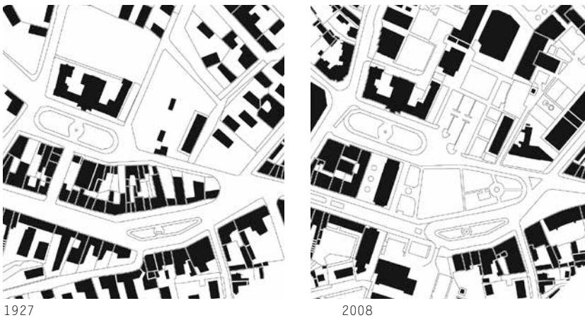
Figure 6. Kragujevac town square transformation (V. Djokić, p.364, p.365)