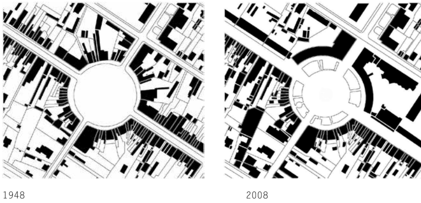
Figure 5. Kraljevo town square transformation (V. Djokić, p.142, p.143)