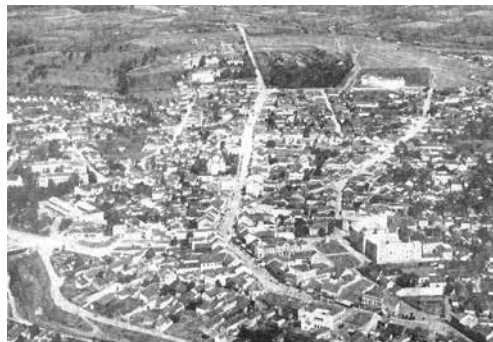
Figure 3. Kragujevac, the town plan and the old photograph from 1930s (B. Maksimović, fig. 27, p. 39)