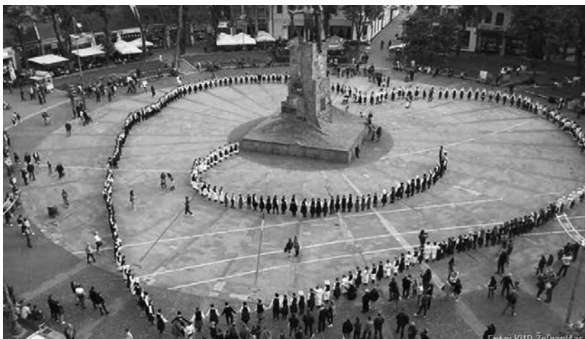
Figure 7. Kraljevo, Festival of children's folklore ensembles. May, 2016 ( https://goo.gl/images/vAzHU6 )

Using the criterion of flexibility we ensure the acceptance of the square space precisely due to the adaptability of space to new needs and initiatives. The adequacy of use of space is estimated in relation to destinations. The greater the number of destinations, the less the chance of inadequate use of space. If despite a great flexibility of space, there is still inadequate use of the square, the causes should be sought in unresolved problems of the central city zone (e.g. the usurpation of public space by parked cars is the consequence of unresolved issues of parking in the larger square area).