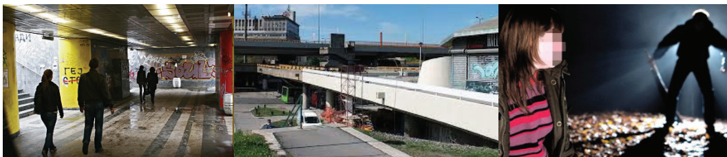
Picture 1. Underway Picture