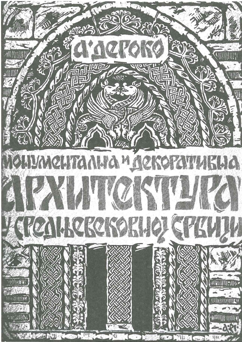
Fig. 1. Book cover of Monumental and Decorative Architecture in Medieval Serbia (1953) by Aleksandar Deroko.