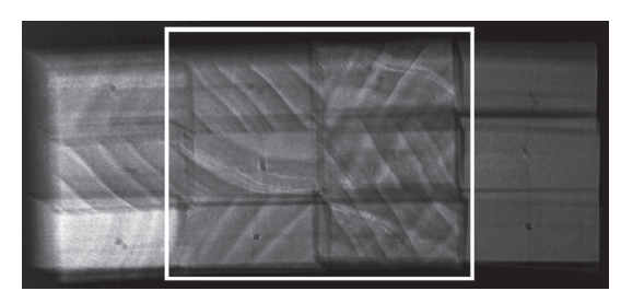
Figure 6. Image of network