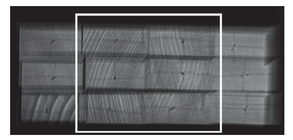
Figure 7. The broom trace of beech samples