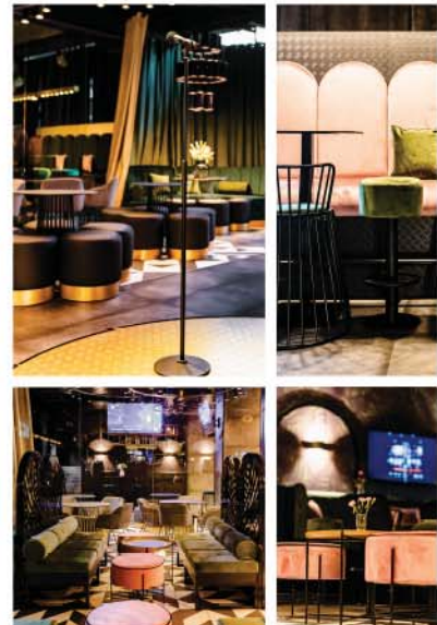
SOHO Vienna, Karaoke & Cocktail bar