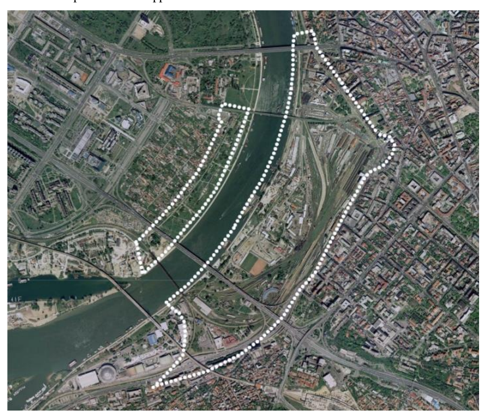
Fig. 1 Location of the Belgrade Waterfront Project

the Sava amphitheater as one of the most important urban complexes in the central area of the old Belgrade as a new center of town at the Sava river and recognizes large projects as an instrument of the implementation of the plan [8, p. 1003]. For these reasons, taking advantage of the strategic potential of this area in the context of European integration and the new image and the modern spirit of Belgrade in the competition with other European and world cities represent an imperative. It is also an obligation for all actors who make decisions about the future development and the appearance and character of the area.