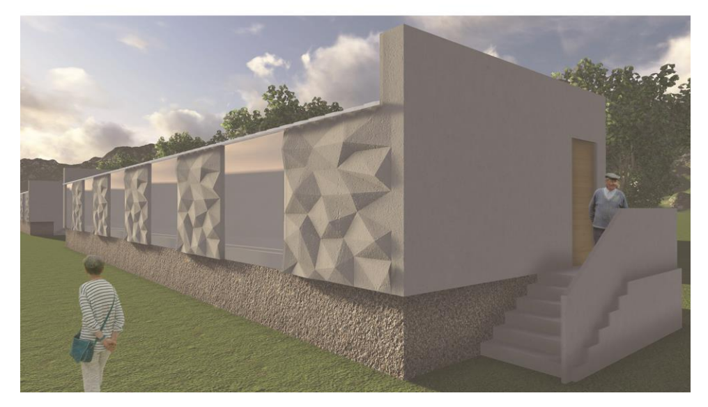
Fig. 3 Design solutions for small family homes produced in the Active House Workshop, student-designers: Uroš Vuković, Petar Veselinović, Borko Marković

When it comes to including additional energy sources, in local conditions this would primarily mean integrating solar panels in the overall design of the house. Considering that the number of daylight hours in Serbia is 1500 – 2200 per annum, it is completely unclear why solar energy is always left out of consideration when it comes to deciding upon standards which must be followed, above all, while building family homes (Lazarevic, 2013). Family homes in Serbia, equipped with photovoltaic solar accumulators and solar powered boilers for heating water would most probably produce more than the necessary amount of energy which is consumed during favorable weather, which leads us to the question of the possibility of including additional small producers in the energy