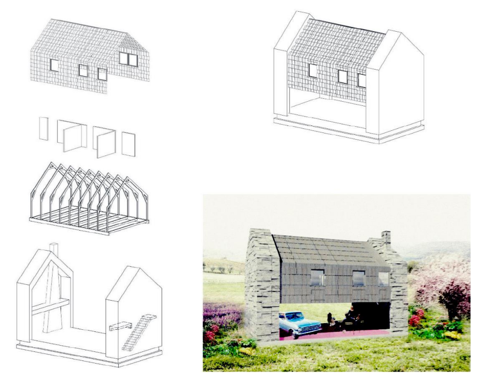
Fig. 1 Design solution for small family homes produced within the framework of the Active House Workshop, student-designers: Anđela Nikolić, Ana Obradović and Ana Popović

Possible levels of capacity realization of the Active House include three goals which are to be met through nine principles, with recommendations concerning the lowest standards for each one. As long as levels of realized standards are higher or equal to recommended lowest standards, the house can be characterized as Active, within the framework of 'active' capacities which it has realized. The Active House radar is a tool which shows the manner in which all standards of the principles within the framework of resolving each problem depend on each other. It is possible to apply it to newly designed houses as well as houses which have been reconstructed. When a house is inhabited, the radar can be useful in monitoring and improving housing conditions. As a means of communication, it clearly demonstrates the significance and importance of taking into account all nine principles in order to achieve maximum capacity realization of the 'active' principle.