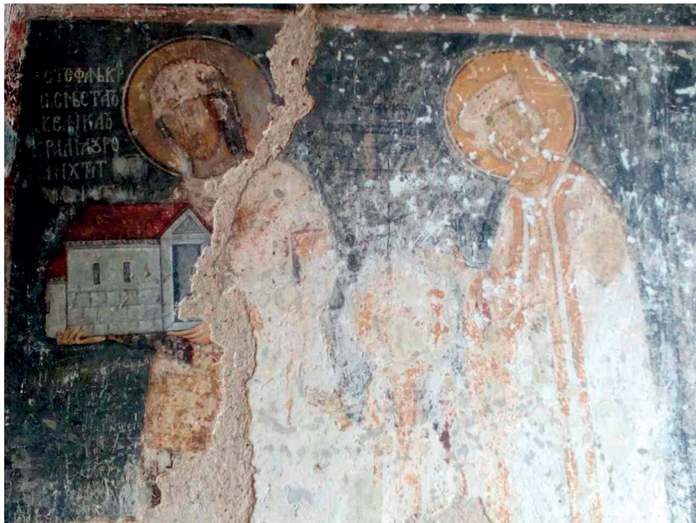
Fig. 5. Chapel of king Dragutin, donor portraits, 13 th century, Monastery of Đurđevi Stupovi

side of drum enlivened with colonettes. The western part of the church played the role of the narthex, and was flanked with two tall towers of square ground plan. Unlike the older St. Peter's Church, the one dedicated to St. George was built under the strong influence of western architecture, even supposedly by western builders (Ćurčić 2010, 495; Marković 2016b, 171). Wall paintings are only fragmentarily preserved, some of them removed from their original place to the National Museum in Belgrade, because the church stood roofless for a long time. Within the complex there is another sacral building, the funerary chapel of the founder's great-grandson, king Dragutin (1276–1282). It was created in 1282/83 by transforming the entry tower of the fortification into a chapel adorned with monumental frescoes of exquisite quality that are an important source for researchers, not only for their artistic but also for their historical value (Fig. 5). At the same time, a new refectory