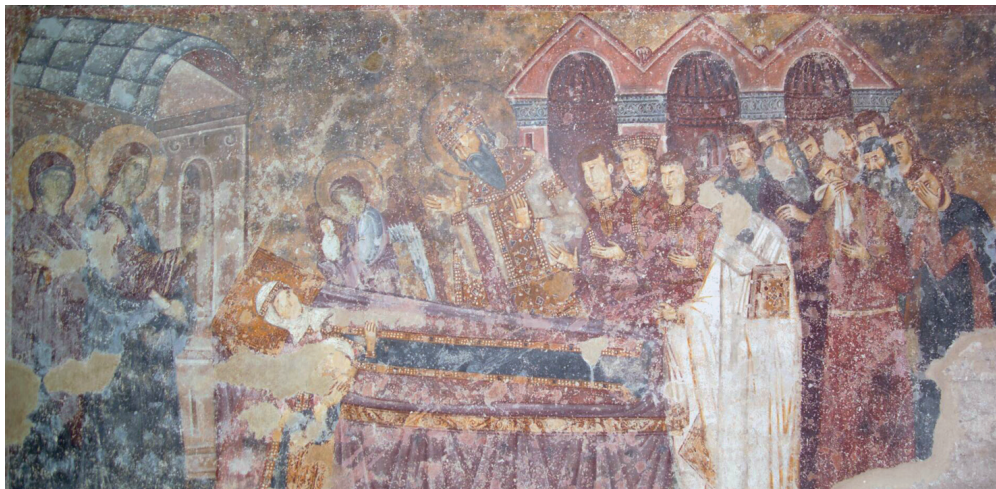
Fig. 7. Death of Anna Dandolo, fresco on the north wall of the narthex in the church of the Holy Trinity, 13 th century, Sopoćani monastery

founder (Fig. 7) (Đurić 1963; Čanak-Medić and Todić 2013, 118–179; Komatina 2014 with sources and older literature; Todić 2016, 223–227). Archaeological research unearthed several medieval monastic buildings within the monastery complex, such as the refectory west of the church (Kandić 1984, 7–16).