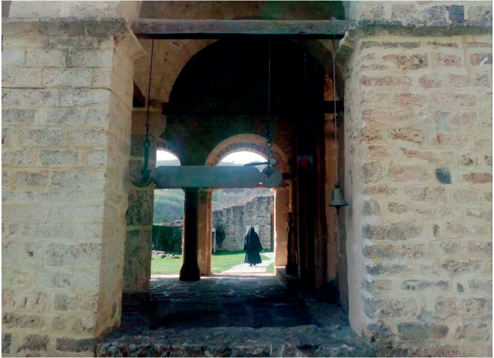
Fig. 9. Living monastic community, Sopoćani monastery, view through the exonarthex

mind that the Sopoćani monastery was and still is a living community (Fig. 9), and that the monastic life in Đurđevi Stupovi has lately been renewed (Debljović Ristić 2011, 165–169). Unfortunately, adequate legal regulations were not adopted because the 1990s were marked by the disintegration of Yugoslavia, civil wars and economic collapse, followed by the termination of funding for research projects and conservation. As a consequence, organised heritage protection gradually ceased to exist. Out of all these institutions, only the Republic Institute for the Protection of Monuments of Cultural Heritage, as the leader of the project, continued to perform adequate actions as much as possible.