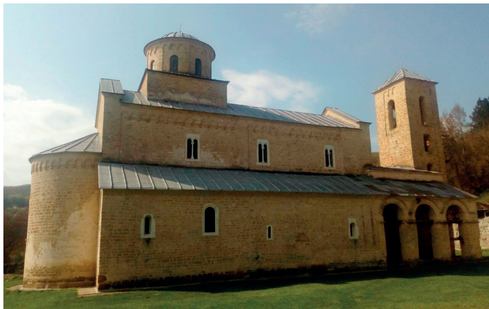
Fig. 6. Church of the Holy Trinity, 13 th century, Sopoćani monastery, view from the north

and dormitory were erected and the church narthex was covered with frescoes (Nešković 1984, 3–10; Čanak-Medić and Bošković 1986, 54–76; Čanak-Medić and Todić 2013, 56–80).