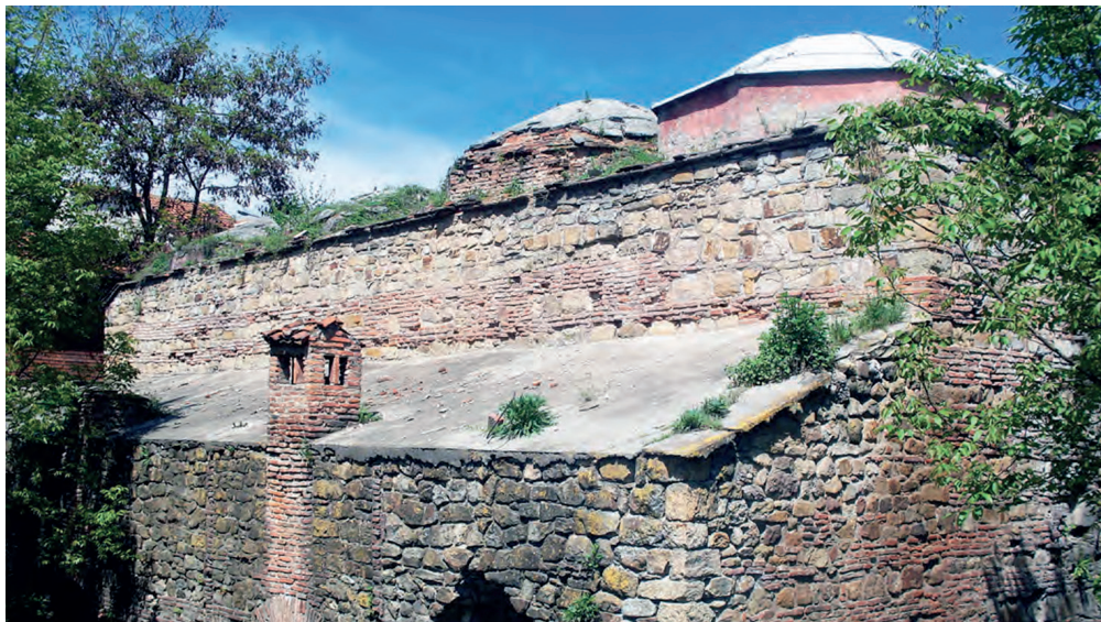
Fig. 8. Isa-beg's hammam, 15 th century, Novi Pazar

Finally, as we already said, in 1979 this complex entered the list of World Cultural and Natural Heritage sites, primarily as the core of the first Serbian medieval state. Since that moment on, the most visible consequence has been the change in the methodological approach to research of those monuments (Sekulić 1985, 251–271). A national programme was adopted for the years 1984–1990 that purported the research, protection, spatial regulation, revitalisation and management of this area. It was the first long term programme in the history of the protection of cultural heritage in Serbia. The programme also purported a special fund for all the necessary activities, and the participation of all relevant scientific and cultural institutions as well as the Ministry of Culture of the Republic of Serbia during the entire period. Such an approach enabled strict control over the spending of funds, a continuity of the financing and works, as well as the promotion of those immovable heritage sites and monuments, through valuable popular and scientific publications. The idea was also to adopt various categories for the monuments in this spatial cultural and historical area, as well as adequate regimes for the protection and usage of each category (Nešković 2011, 145–150; Kesić Ristić 2015, 97). This was very important for the living monasteries and the growing city of Novi Pazar. One must bear in