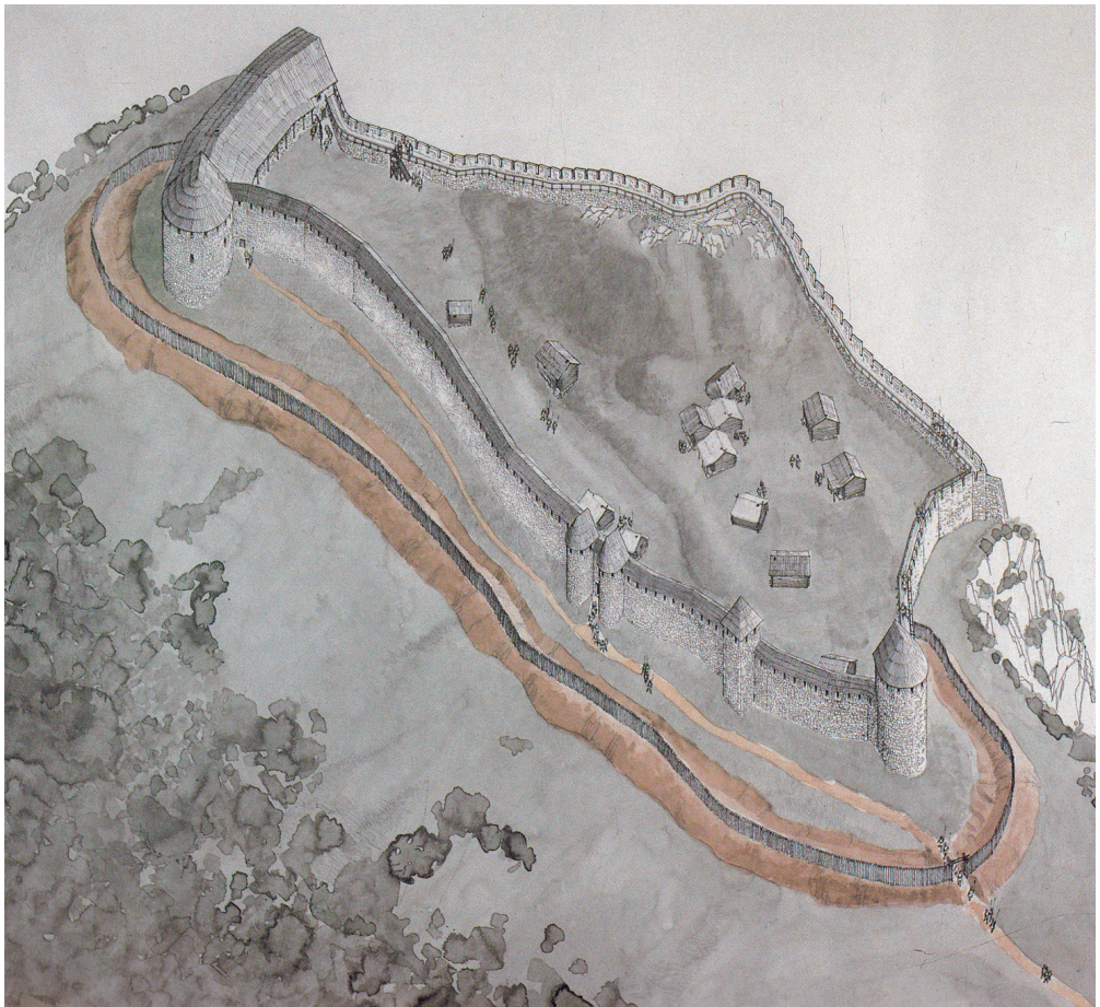
Fig. 2. Fortress of Ras – reconstruction by M. Popović

Archaeological investigations showed that it was restored as a stone fort and was in use in the 12 th /13 th centuries, which, along with its position and data from historical sources, was why it was interpreted as the seat of Nemanja's state (Fig. 2) (Popović 1999; Čanak-Medić and Todić 2013, 14–19). In the vicinity of the fortress, a cave monastery of St. Michael is situated (Popović and Popović 1998), as well as the multi-layered site of Trgovište (named also Pazarište), likewise used and inhabited for a long time, from the late antique period marked by sacred buildings and a necropolis, to a medieval settlement founded in the 14 th century. The importance of Trgovište lied primarily in the fact that it was a mercantile centre situated on a route that connected the Adriatic shore to the Balkan