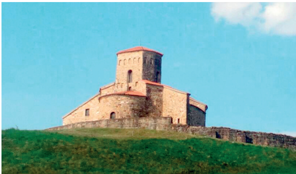
Fig 3. St. Peter's church with recently added bell tower, 9 th /10 th century, Novi Pazar

hinterland, which is testified, among others, by the information from the Archives of Dubrovnik that merchants from Dubrovnik had their colony in Trgovište (Kalić 1994, 10; Čanak-Medić and Todić 2013, 20). When the medieval period is in question, archaeological excavations resulted in the discovery of a settlement and several single-nave churches. Although written sources mention the Catholic church of St. Triphon, protector saint of Kotor, who was likewise venerated in nearby Dubrovnik, it seems that it has not yet been discovered since all the excavated churches are of the Eastern type and arranged for East-Christian liturgy (Čanak-Medić and Todić 2013, 22). After Trgovište went into the Ottoman hands, the settlement diminished in importance primarily because Novi Pazar, founded in its close vicinity, took primacy as a new mercantile centre (Premović-Aleksić 2014, 226).