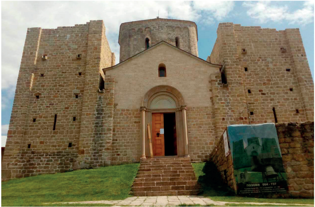
Fig. 4. Church of St. George, Monastery of Đurđevi Stupovi, 12 th century, view from the west

it was recognised as the place of Nemanja's second baptism (Stefan Prvovenčani, II). Centrally planned as a rotunda with three trapezoidal conchs in the north, west and south and a deep semi-circular apse in the east, as well as a low gallery in the upper zone above the ambulatory, St. Peter's Church still attracts attention of researchers as a multi-layered site continuously in use until this day (Nešković and Nikolić 1987, 13; Popović 2000; Ćurčić 2010, 342–343; Čanak-Medić and Todić 2013, 26–49; Marković 2016a, 147).