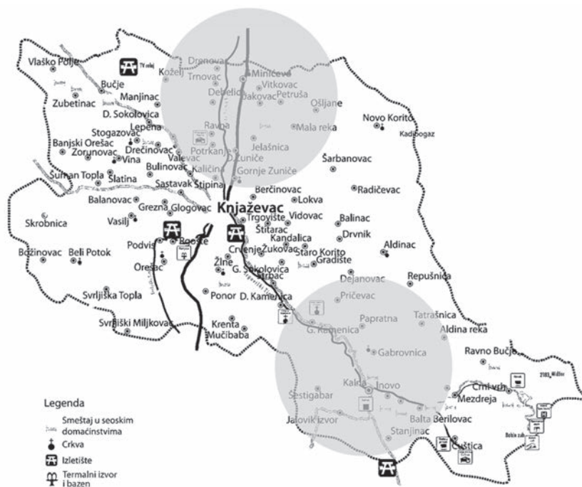
Figure 2. Knjaževac tourist map