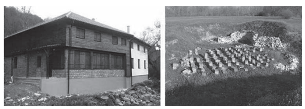
Figure 3. (on the left) Montain lodge in village of Dojkinci, Pirot and Figure 4. (on the right) Remains of roman baths in Ravna village, Knjaževac

Minićevo belongs to the category of clustered settlements. According to its spatial and geographical characteristics, it represents an important link between smaller rural settlements and larger centres, such as Knjaževac. The location of the settlement, near the Kadibogaz border