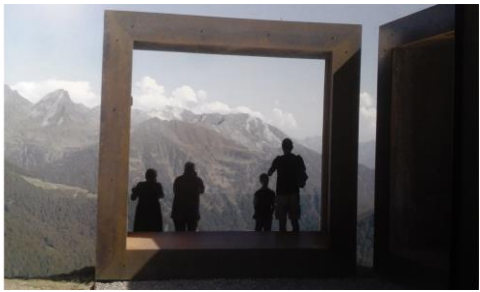
Fig. 3 Primary visitor spots: A vista of lake Perucac from "The Cross" on Tara (from "Drina" monograph – Institute for textbooks and teaching materials – Belgrade), and Lookout Timmelsjoch – Austria/Italy (Architect WernerTscholl) on the cliff side lay-by (journal C3 no. 359/2013.)

Newly formed spatial structures do not necessarily have to be physically connected. They can be integrated into a system of pavilions with several independent facilities. In that way the facilities can be constructed in stages, i.e. the offer can be incrementally improved, depending on the interest of potential consumers. Of course in such cases, especial care needs to be paid to the aesthetics of the complex being developed during a longer time period, i.e. the form of the whole structure needs to be defined while the idea is still being formulated.