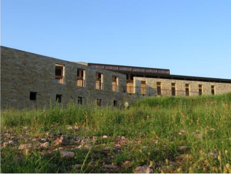
Fig. 4 Memorial Home in Ravna Gora (designed by architect Spasoje Krunic) by the structure of its facilities represents a Visitors' centre at a historical site, with basic (info-presentation) and minimal accommodation facilities (From the authors' archive)