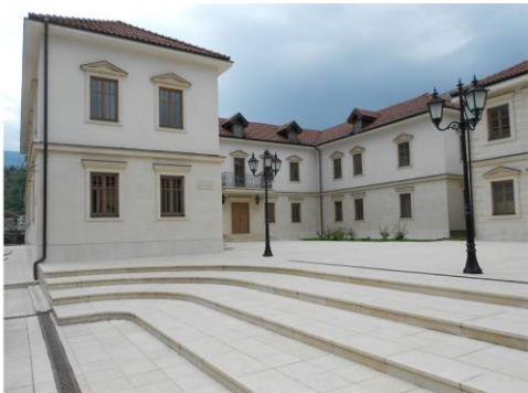
Fig. 2 New ethno-style settlements, as a specific type of Visitors' centres with complete packages of events and activities (Drvengrad Mecavnik in Mokra gora on Tara Mountain and Kamengrad, Andricgrad on the river Drina – Visegrad / RS) (From the authors' archive)

The same usefulness-based philosophy applies to Mecavnik, where visitors come not only for basic services, but also in order to participate in now traditional festivals, concerts, events, and the wider region also provides interesting sights, such as a rehabilitated narrow-gauge heritage railway, Sargan Eight, and other attractions in the direction of Uzice and Visegrad, or Bajina Basta across the Tara mountain.