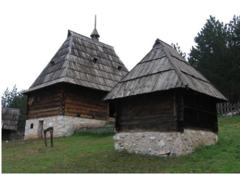
Fig. 1 Facilities with the potential to assume the modern function of benchmarks – Visitors' centres in their proper communities: Ethno farm (backyard) Latkovac near Aleksandrovac, and the Open Air Museum – Staro Selo in Sirogojno, formed from preserved and transported vernacular buildings.

It would also be pertinent to mention large number of facilities, either in rural settlements or outside them, which have lost their initial importance and purpose, and which could – post-rehabilitation – become a synergy points for tourism actions in Serbia (cooperative buildings, trade cooperatives, depopulated schools, valuable and rehabilitation-available vernacular facilities with traditional construction elements, abandoned barracks, and many other existing forms in rural areas who can be used owing to their preserved intrinsic value). This would achieve at least two positive effects: rescue of buildings from falling into disrepair, and placement of new functions important for survival of villages through tourism development.