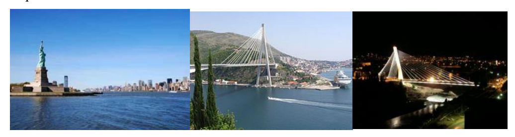
Figure 3 . Statue of Liberty in New York harbor. Bridge towards Dubrovnik port Gruz. New bridge Millenium in Podgorica.

Some other changes of the image of the city, beside cataclysms, occur considering its expanding and changing the element of urban core. Thereby, elements appearing to be structural features and city landmarks on macro urban plan are considered. However, within the environment people live in, work and go out on daily basis, every change of the surrounding elements represents perceiving target and redefining of image acquired.