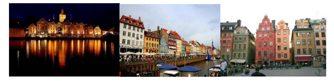
Figure 6. Stavanger-Norway; Copenhagen and Stockholm; façade main street made of different structures. As such, they are memorable existing image resistant to changes.

Once established spatial relation, remembered as a preserved unit, the typical image is made. Each change of any elements, buildings in this case, building of new ones, demolishing the existing ones or important intervention on them, will provoke our attention to trace back the previous memory and to redefine it. It does no harm to remember the music and melody tunes, because it is the easiest way to comprehend composition of the architecture. Each change of tone leads to the new experience of melody. Or even better, let's involve the linguistics in all this. Logical and harmonious union of architectural facilities is the same as suitable or meaningful order of letters giving the word, for example S U N. If we remove a letter, we get S N, meaning nothing, or if we add two of them K S L N. If we use the same letters and put them in different order, there is a decomposition effect S N U. This comparison is usable indeed, so the perceiving is an element to be reactivated because of the "excess in space". In this case, a new memory and adopting it o recently altered picture and image perceived is required.