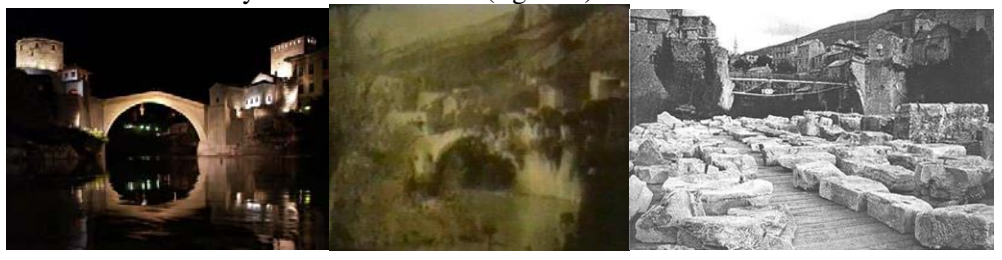
Figure 2. Mostar bridge after the reconstruction, at the moment of destruction, and just before the reconstruction.

It is common for most urban areas to be identified with certain visual notion, observed and memorized as a typical silhouette or their result. Disappearing of such capital image of the city significantly questions visual defining the city. That is not easily re-created because it significantly depends on time as crucial factor. Many cities depend on domineering and indentifying landmarks in their visual identification. Such examples are numerous, but the most recent example is City of Mostar and its notion. The famous bridge, that ceased to exist during war years (1992-1995), submits factor of disappearing of one typical image, having the trademark of the city without alternative (figure 2).