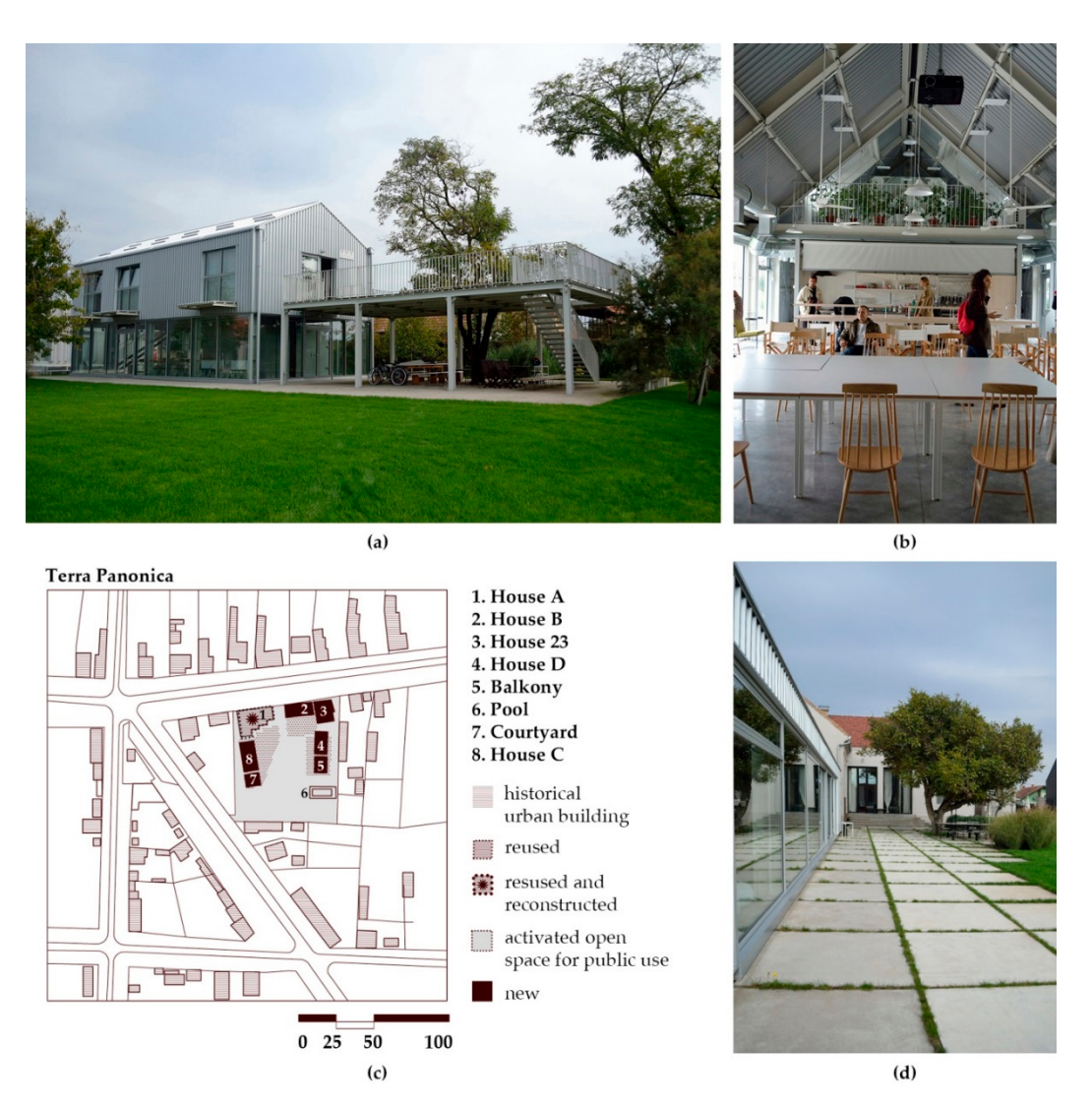
Figure 2. Terra Panonica in Mokrin village—modern cultural and touristic center for creative industry: insertion of new contemporary buildings and preservation of existing traditional houses, ( a ) Modern design of the house D; ( b ) House C for indoor events; ( c ) Spatial layout of the compound; ( d ) New house C in relation to the reconstructed house A.