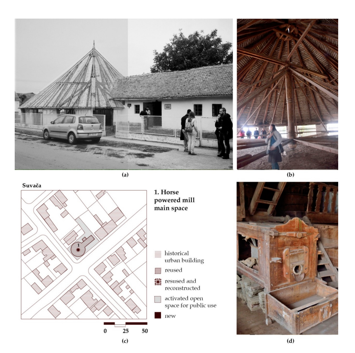
Figure 4. Suvača—the horse-powered mill ( a ) Unique roof clay tiles; ( b ) Restoration of interior timber structure; ( c ) Spatial layout of Suvača and activated space for public use; ( d ) Grinding grain machine.

Adaptive reuse of the old horse-powered mill for touristic and cultural purposes, supported by the restoration of unique interior elements of timber structure and use of traditional and original materials of roof clay tiles, enabled the continuation of the original use of flour production in a contemporary manner. From a symbolic standpoint, Suvača presents evidence of a lifestyle and identity of the Banat region grounded both on the tangible aspects of the outstanding cultural significance of the horse-powered dry mill, as well as an intangible aspect of preserved original processes for occasional grain grinding. Adaptive reuse of Suvača included additional new usages of educational workshops for food preparation, which are complementary to the original functional layout and architectural space.