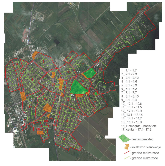
Figure 2: Map of Vršac divided into macro and micro zones for the purpose of bottom-up sample gathering