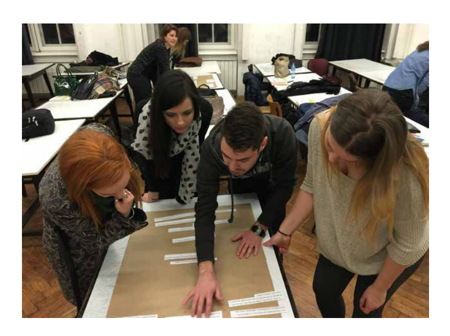
FIG. 4.3 Workshop

The project development process is designed to allow continuous, active, and constructive communication amongst students (Figure 4.3); between students and mentors, the city administration and residents of Pančevo (Figure 4.4), and the professional and academic communities; and between Pančevo officials and consultants.