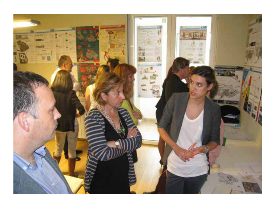
FIG. 4.1 Workshop with consultants

In addition to being able to confer with their mentors and commission members from the Faculty of Architecture, the students could also consult officers of the relevant institutions and organisations, such as the Ministry of Construction, Transportation and Infrastructure, Serbian Institute of Architecture and Urban and Spatial Planning (SIAUSP), Belgrade Town Planning Institute (TPI), Serbian Chamber of Engineers (SCE), Kragujevac Directorate for Urbanism (DU), and GIZ/AMBERO of Belgrade (Figure 4.1).