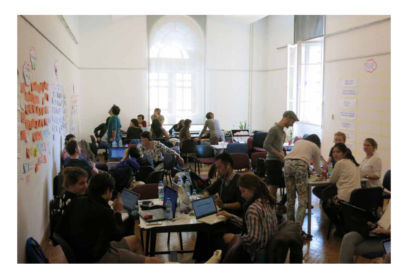
FIG. 4.2 Workshop of TU Berlin and AF Belgrade students