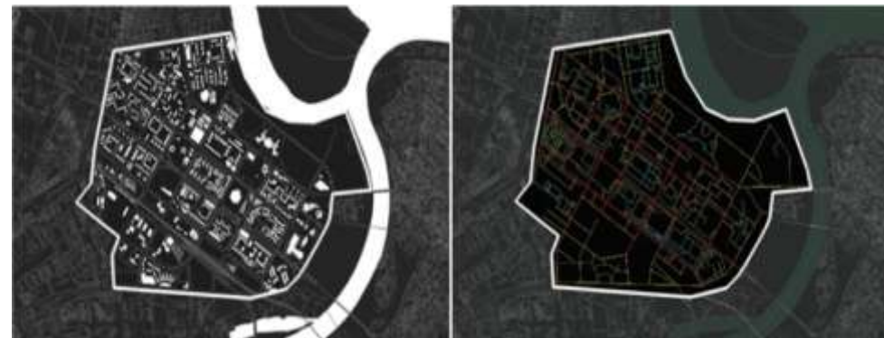
Fig. 5: The Volume subsystem. Right: Interface. The warmer the colour indicates the higher of mean depth for the link: (the analysis is carried out using the software "Dephtmap" developed by Space Syntax team in University College London).

Therefore, due to the morphological arrangement of New Belgrade's defined by the urban blocks and fabric (Volumes), Interface as the flowing quality inside the urban cavities appears very low and on the opposite a high level of separation and segregation emerge. As Henri Lefebvre, Serge Renaudie and Pierre Guilbaud formulated in their critique of New Belgrade, "the separation and isolation of normally linked activities engenders a sclerosis of each element, and the functionalism of the whole", which further, "prevents solidarity and sociability and compromises the development of the individual and the collectively. [10] Furthermore, the specialization and separation of the different levels of movability (pedestrian, bicycle paths and different ranks of motorized) inside the urban voids as well as the detachment of the two part of New Belgrade separated by the urban highway, participates to decrease the level of complexity of the system.