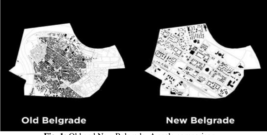
Fig. 1: Old and New Belgrade. A scale comparison

the transformation of block 39 seen as local scale in the transformation process could play the role of a catalyst able to initiate a no-linear chain reaction to transforms the intermediate scale (New Belgrade) and eventually affecting the entire structure of the city of Belgrade seen as a CAS.