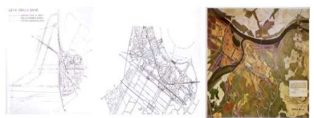
Fig.2 on the left: Sketch regulation Belgrade on the left bank of the Sava, Arh. N.Dobrović, 1946 (Stojanović&Martinović, 1978: 43); center: The conceptual plan of New Belgrade, Novi Beograd Group, 1948 (Stojanović&Martinović, 1978: 44); right: General Urban Plan for Belgrade, 1951 (Stojanović&Martinović, 1978)

In addition to units that are in the regime of protection as cultural and natural resources, the buildings and urban-architectural areas of modern epoch have been protected in the regime of complete and partial protection, and defined by the zoning recommendations for further treatment in terms of preservation and promotion of authentic values of modern urbanism and architecture (GUP, 2003). Further development of centers in New Belgrade - through transformation of existing and development of new capacity - has been