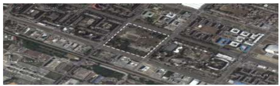
Fig.3 Block 39 and its environment. IV. IMM INVESTIGATION PROCESS: THE ROLE OF KEY CATEGORIES

The Ministry of Science has launched the idea to build Center for the Promotion of Science and Nanocenter. The idea was initiated with implementation of the architectural competition to select a representative building of the Centre for the Promotion of Science. The contest was completed in 2010 with the winning solution of Austrian architect Wolfgang Tschapeller. However, with change of national and city government, the idea of realizing this project was stopped on the grounds that it is too expensive to implement at this time. Regardless of the current halt in the construction of this block, previous strategies, regulatory plans and competitions clearly directed its development towards educational, scientific and cultural functions.