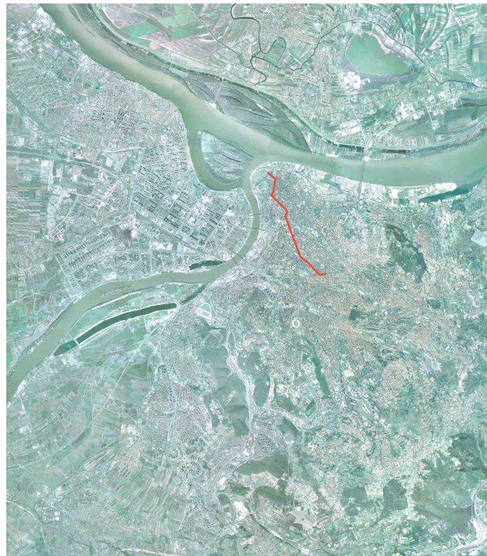
Fig. 1: Belgrade metro line – 1958 proposal

Novel five figures (Fig. 1 to Fig. 5) are completed for this paper, with the objective to enable convenient comparison among four different metro proposals (Fig. 1 to Fig. 4) and light rail proposal (Fig. 5). In these figures, the same aerial map of Belgrade is used as a base. Applying existing data (Dobrovic 1958, Janic 1968, BDBR 1976, Maletin 1993, ABLCB 2008), five different proposals are presented, i.e. the rail lines of each proposal are drawn. Networks, directions and lengths of lines can be easily visually compared by five presented figures.