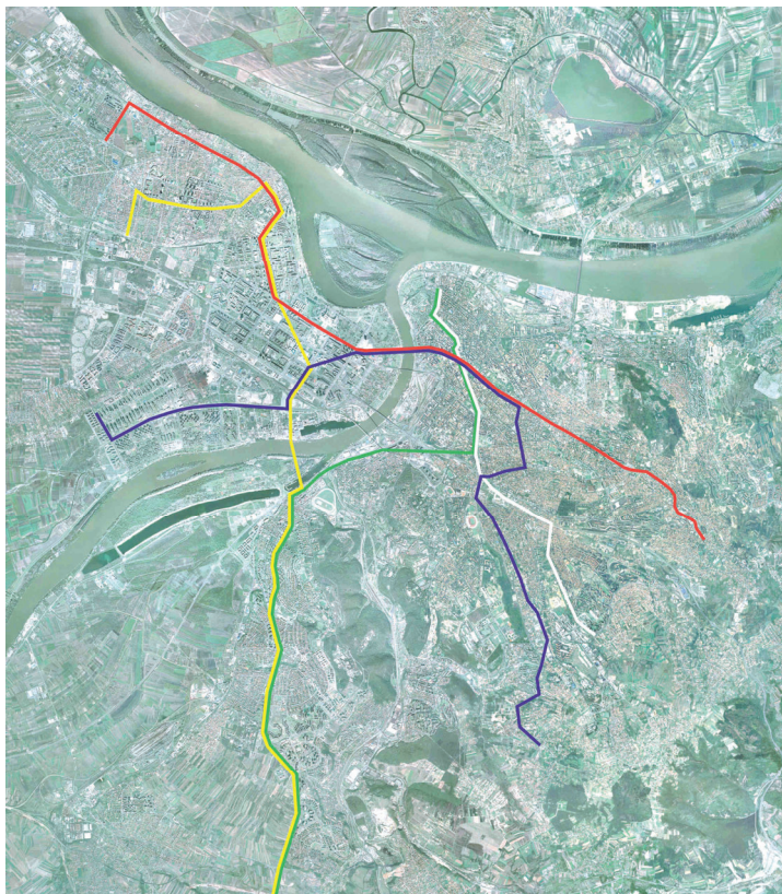
Fig. 3: Belgrade metro lines – 1976 proposal