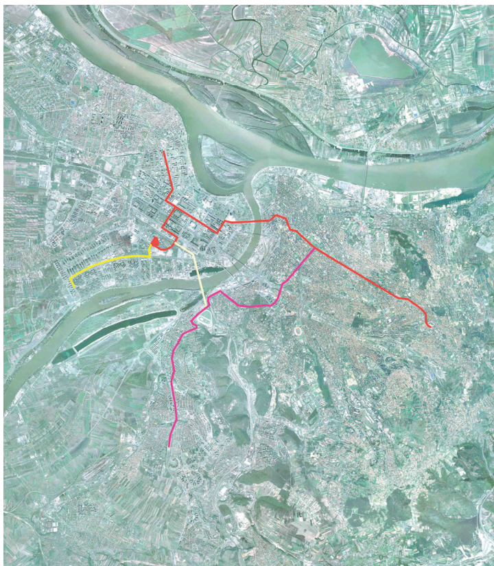
Fig. 5: Belgrade light rail lines – 2006 proposal