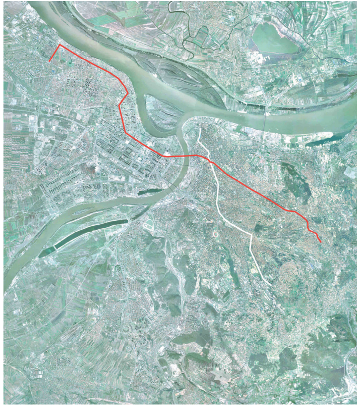
Fig. 4: Belgrade metro lines – 1982 proposal