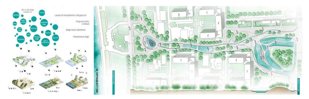
Fig. 2 Case 1 - "Water leads to water" - Milica Pavić

The project explores the relationship of the Block 45 with water, based on the fact that the block is located on the Sava riverfront and that this feature defines the block's identity. Moreover, the groundwater levels in the block are high and it is often threatened by flooding.