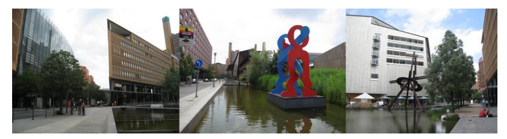
Fig. 1 Potsdamer platz, Berlin – multifunctional use and ecosystem services (A. Kujučev)

This restricts the full use of the concept of multifunctionality of landscapes and open spaces for sustainable urban development.