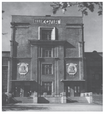
Figures 5 & 6: a plan and School from 1930s

The area has a lot of interesting buildings from the point of view of architecture. One of them is Madrid Hotel being an example of the enriched constructivism — the active volumetric composition is 'covered' with stucco-molded décor being in fashion at the end of the 30-ies. The legend says that the hotel received its name because of the civil war in Spain. It was one of not-declared wars, in which the USSR armed forces took part informally. The Soviet Union sheltered refugees. Some of them, according to the legend, were placed in the just built hotel building. Apparently, Spanish hostel in the center of the Uralmash district looked very vividly. The present Uralmash is a reserve of contemporary architecture representing five-floor houses and grandiose public spaces buried in verdure. It is the only districts in Yekaterinburg, where some public transport (trams and trolleybuses) have routes that do not run outside the area. A loud and negative glory of the area acquired by it in the 90-ies is a subject of mythologization and even romanticization here and there now.