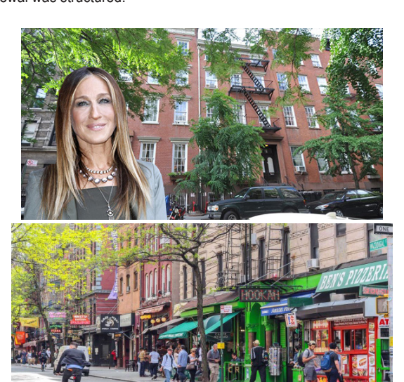
Figure 13: Branding by "Sex and the City" movie; Figure 14: Urban regeneration in old way, without new inserted architecture

The aim was bigger: Village has to remain the symbol of the originally Dutch old quarter famous for its non tangible legacy as openly shown liberties: off Broadway theatres, cabarets and music scenes where their starts had famous stars like Bob Dylan, Barbra Streisand, Simon and Garfunkel, Liza Minelli or Joan Baez. Hippie atmosphere and environment where also the energy of jazz music unified black and white people - Afro-American style due to its nightclubs, where Nat King Cole, Ella Fitzgerald and Billie Holiday performed at that time performed the cultural and social diversity. Although the modesty of those buildings the strategy of Urban renewal sought to preserve in the way it was in the midst of the Century. Also, first gay communities showed freely in this quarter, so the spirit of informal way of living was the one worth of preserving.