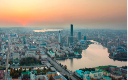
Figures 3 and 4: Yekaterinburg today

Yekaterinburg, or Sverdlovsk during communist era, became the first city in the Soviet Union outside the two capitals to build a subway from its own resources. From broadcasting canter in II World's war, to activate like movie industry, theatre festivities till first nuclear-powered submarine K-84 named "Yekaterinburg" and built in 1984 – this city is full of different activities and specifics. Due to its natural resources and economically wealthy environment, for several years in a row Yekaterinburg has been leading in the national rating of cities "most attractive for business". Yekaterinburg, as a place of different innovative attempts, as well as the rest of the Urals, is directly related to the beginning of the space era. The first transmitter for receiving satellite signals from space was invented here as well. So, innovation and cultural affection