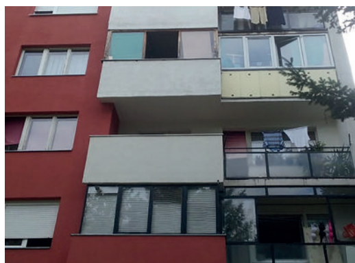
Figure 4 - Building appearance after refurbishment, street Dr. Nike Miljanica, Karaburma, Belgrade

In addition to above mentioned interventions, some tenants have expanded living space by closing the balcony (Figures 3 and 4). Façades were painted in different colours which improved the identity of the neighbourhood.