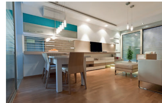
Figure 7 - Interior of the apartment after the refurbishment (authors: B. Begenisic, S. Markovic)