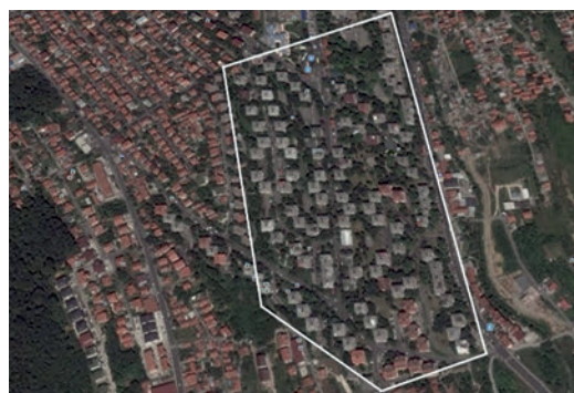
Figure 1 - Position of retrofitted buildings in Karaburma, Belgrade

In 2009 the refurbishment of Karaburma settlement began (Krstic-Furundzic and Djukic 2014). Most of the renovated buildings expanded by one floor at the top of the building, terraces were added or they widened the existing ones, exterior walls were lined with thermal insulation and old wooden windows were replaced. Part of the settlement along the street Dr. Nike Miljanica is analysed in this paper (Figures 1 and 2).