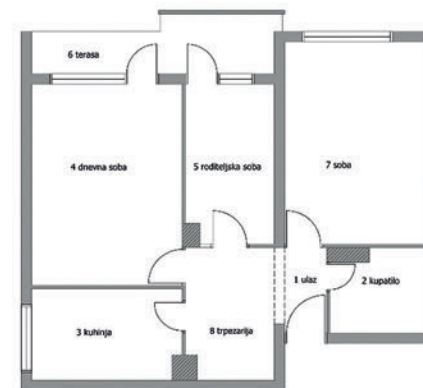
Figure 5 - Plan of the apartment before the refurbishment

Subject of this LCC analysis is one of the apartments from the renovated building in Karaburma settlement (Figures 5, 6 and 7). The goal of this LCC analysis is to evaluate economic efficiency and feasibility of façade improvement on prefabricated, multifamily housing in Karaburma, Belgrade. LCC analysis evaluates feasibility of measures taken to improve thermal performance of building envelope in order to reduce energy demands for space heating.