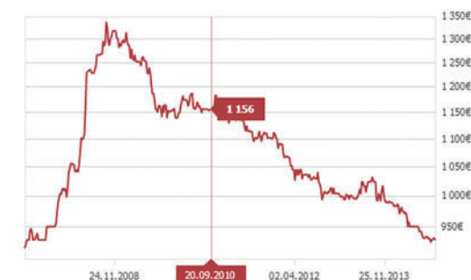
Figure 8 - Seven year back period: example value of one bedroom apartment at the end of year 2010 in Pere Cetkovicastreet in Karaburma, Belgrade

Similar apartments to the selected one in the analysis, with improved envelope thermal properties, at the same location in spring 2011, had a market value around 1,150 €/m 2 , while apartments with poor envelope thermal properties had up to 25 % lower value per square meter (900-1,000 €/m 2 ) (Figure 8). These prices per square meter are valid for apartments with good living conditions.