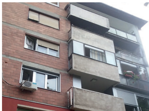
Figure 3 - Building appearance before refurbishment, street Dr. Nike Miljanica, Karaburma, Belgrade