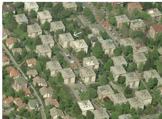
Figure 2 - Position of the retrofitted building on the street, Dr. Nike Miljanica, Karaburma, Belgrade